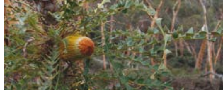
Above Dryandra nobilis.