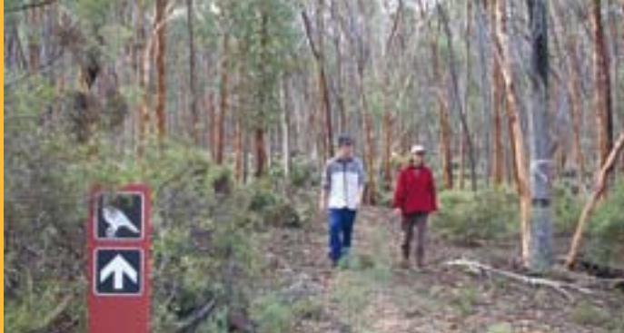
Above Kawana Trail.