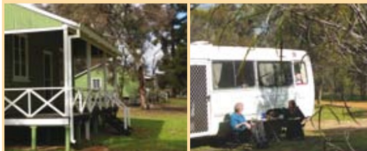
Above left and right Accommodation cottages available at Dryandra; camping at Dryandra.

A pay phone is available at the Dryandra Village Settlement caretaker's office.