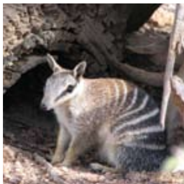
Right A Numbat.

The Department of Environment and Conservation (DEC) has developed a series of walks ranging in length from one to 12.5-kilometre, a 25-kilometre audio drive trail and a 23-kilometre interpretative drive trail. Included is a night walk trail with reflective markers. This walk offers visitors the chance to see some of the woodland mammals which are active at night, such as the woylie, tammar wallaby and brushtail possum.