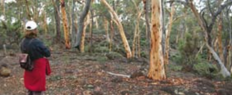
Above A walker on the Ochre Trail.