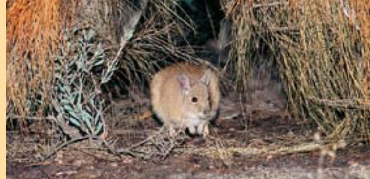
Above A wurrup at Barna Mia.