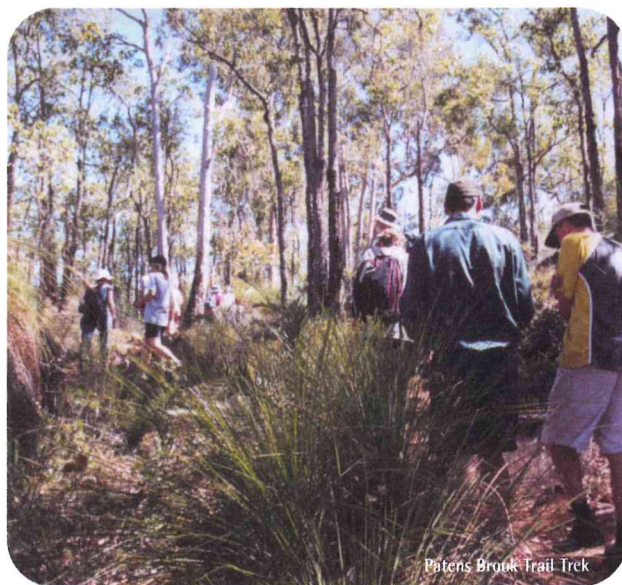
Patens Brook Trail Trek