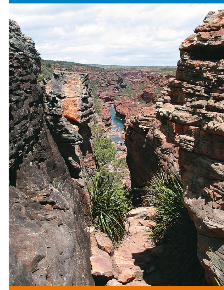
Information and walk trail guide