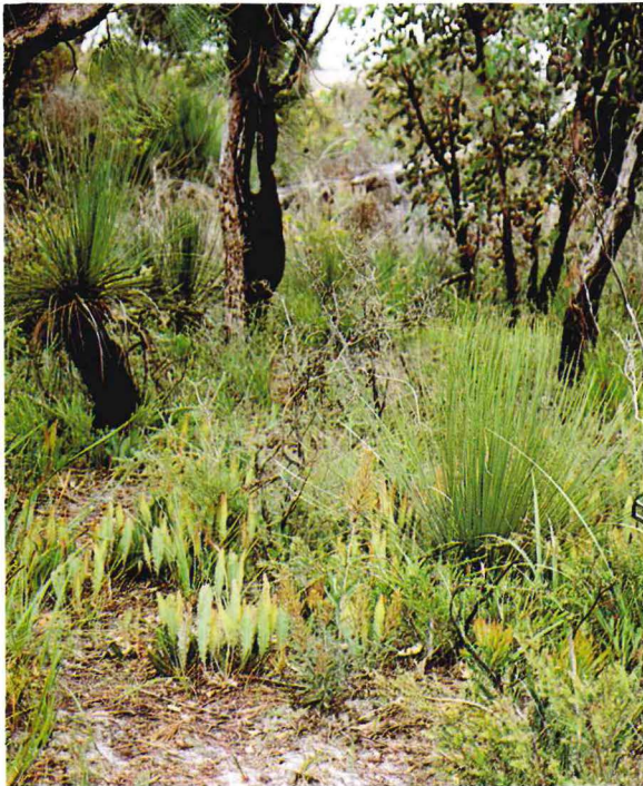
Banksia goodii growing in dense heath (right) and in recently burnt low woodland with Blackboys and Blackgins (above).

The species occurs between Albany and the Porongurup Range, with a geographical range of less than 25 km. It grows in sandy soil in low woodlands of banksias and the Albany Blackbutt ( Eucalyptus staeri ). The average annual rainfall is about 800 mm.