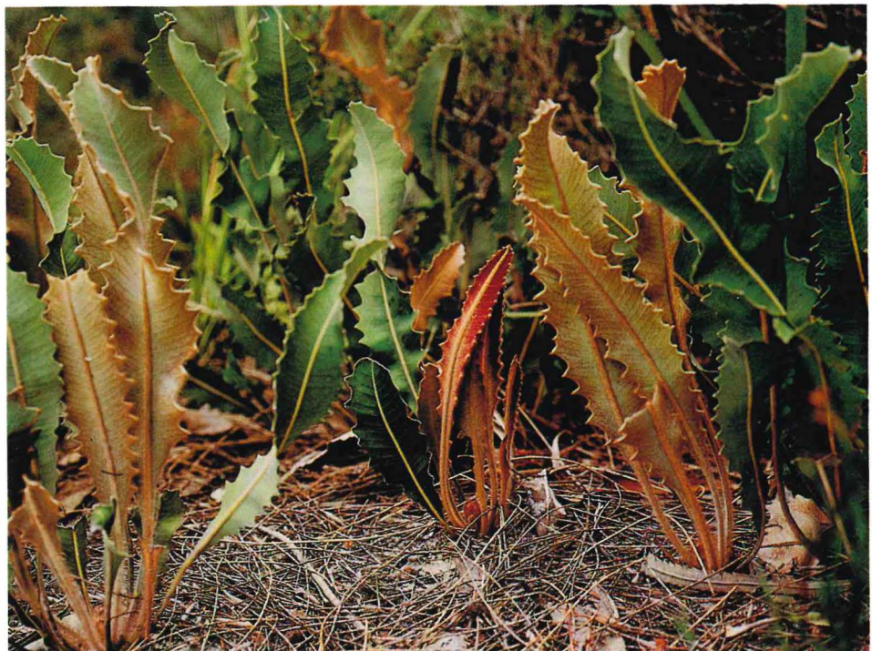
Banksia goodii foliage showing the red tints in its young leaves.

There are several other Western Australian banksias with a creeping habit. Banksia petiolaris shows the closest resemblance to Banksia goodii but can be readily distinguished by its yellow flower cones and by having its narrower leaves borne along the branches. Banksia goodii 's leaves are clumped together, surrounding the flower cones. Banksia gardneri is another close relative which differs in having more regularly lobed leaves and smaller flower cones.