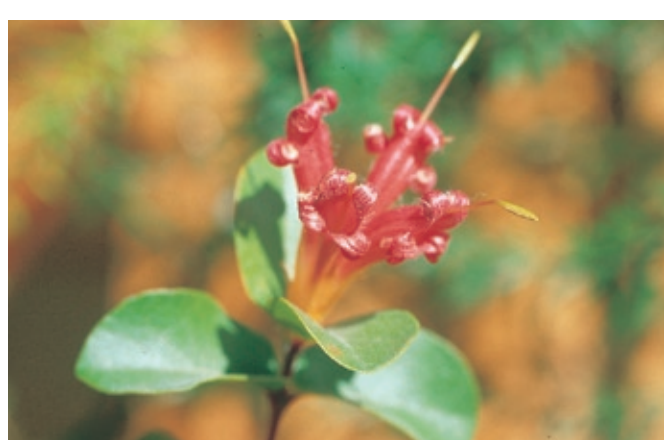
Two subspecies of Lambertia orbifolia—morphologically similar but genetically distinct.

definition of a population and what is local in the field is far from simple, although for rare plants it is likely that they occur in small and disjunct groups or as isolated occurrences. It is important to note that within a population there may be ecotypic, or microenvironmental variations, that require sampling.