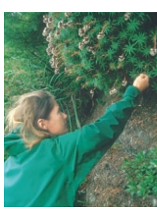
Collecting seeds of the threatened epacrid Sphenotoma drummondi in the Stirling Ranges.