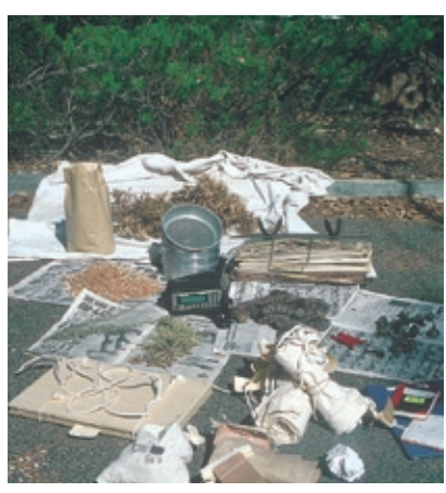
A range of equipment used for seed collection.

As the demand for seed from native species increases it is important that standard procedures are followed. Problems caused by collectors can alienate landowners and land managers, making it more difficult to gain future access to collecting areas, and can deplete plants in a wild population. It is important to know why you need to collect seed in the first place. Then decide what species to collect, where you can collect it, when it will be mature for collection and how much of it is necessary for your needs: