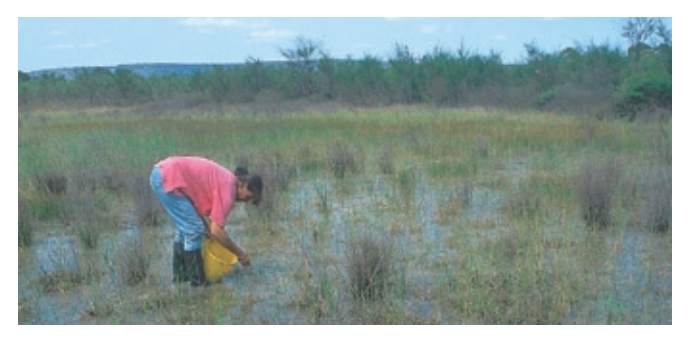
Collecting seed of endangered swampland plants for long term storage.