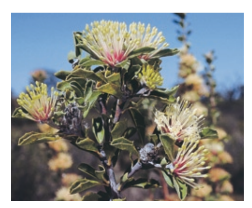
Wagin banksia (Banksia oligantha) has an endangered status.

Once collected, it is important to provide optimum storage conditions if the material is not to be used immediately. These optimum conditions mean seed should be dried (not in an oven but air dried or using a desiccator) and kept cool (in a fridge provided the seed is sealed tight after drying, although freezing of seed will guarantee greater longevity). Seed kept under sub-optimal storage conditions can lose viability very quickly and may not germinate when required. For many species there will be years when seed set fails, and other years when seed yields are above average. Improving the potential for seed storage means that collections of material can be made several vears before they are required in rehabilitation or revegetation programs, maximising the occurrence of heavy yields in response to favourable environmental conditions.