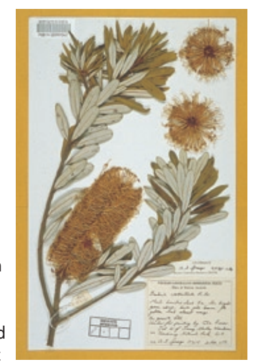
Herbarium specimen.

A specimen that represents the mean of the species is required. Do not collect a specimen from a plant that doesn't look like every other plant. Multiple vouchers may be necessary if plants within the population vary. It is essential that specimens be accurately identified to species level. Voucher material from the population where you are collecting should be retained to ensure verification of the species and for reassessment in the event of taxonomic reviews.