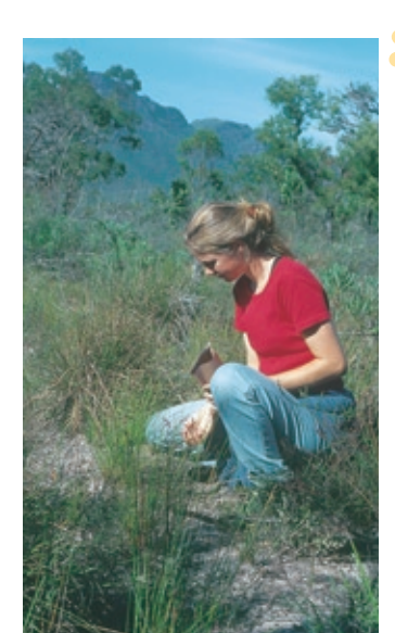
Collecting seed from Verticordia species.

or agencies (for example DEC, the Department of Water, the Public Transport Authority, Water Corporation and Western Power) you must obtain permission from them. Permission to collect seed from private property for non-commercial activities is required from the landholder and a licence for collecting on private property is only needed if the seed is to be used for commercial gain.