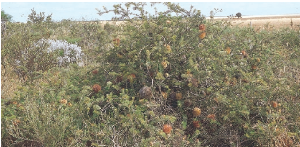
Top left: Banksia media. Top right: Banksia grandis, Walpole Nornalup National Park. Above: Banksia scabrella.