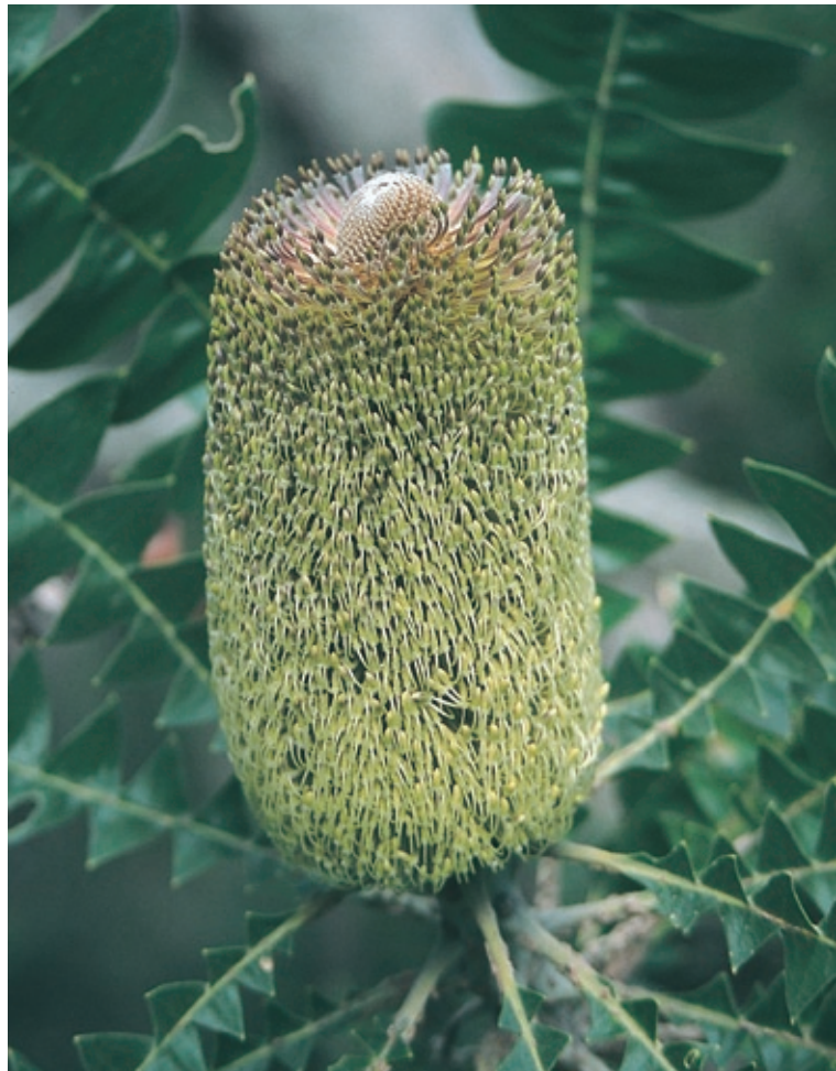
Banksia grandis .