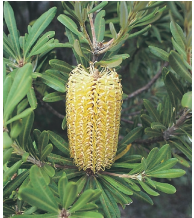
Above: Banksia verticillata .

dense flower spikes, or candles. The flowers are in spikes or inflorescences and may be spherical or globular to cylindrical. Each spike is made up of tightly packed and spirally arranged flowers, although there are a few exceptions. Flower colours are usually creamy-yellow or yellow, although some species have scarlet ( B. coccinea ), bronze, orange ( B. ashbyi ) or purple flowers. The main flowering of most species is in summer, autumn and winter. The leaves may be small and needle-like or large and leathery, often with serrated or deeply divided margins.