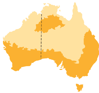
Approximate distribution of Banksia in Australia.

There are over 75 species of Banksia , all but one occurring naturally within Australia. The greatest concentration of species is found in Western Australia. Some species are common and widespread and others are restricted to small isolated occurrences. Many species occur on deep sandy soils, although others are found in impoverished lateritic loams with good drainage. Some species occur naturally on coastal cliffs, in forest and into the inland semi-arid areas. Most are found in heathlands.