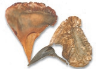
Banksia meisneri ssp. ascendens winged (right) seed and separator (left).

Extracting seed from the woody Banksia cones can sometimes be difficult, and many species require heating or burning before the individual follicles will open. The cones can be passed over a bunsen burner or placed on a barbecue for a short period of time until the follicles crack and open a few millimetres. Cones should then be placed into a bucket of water for a several hours. The cones then need to be dried in a warm oven. Seed should extract reasonably well after this treatment; if not, the wetting and drying cycle can be repeated. Viable seed is white and firm with a dark brown or black seed coat. The seed is flat with a terminal papery wing and sits in a separator or intervening plate in the follicle. This separator holds the seed in place in the follicle. It is important that the separator is not mistaken for the seed. The separator is usually brown in colour, whereas the seed is black. Many species have two seed per follicle. Predation of seed can be a problem, in particular in older cones. Look for signs of frass (the debris or excrement of insects or insect larvae, looks like sawdust) or holes in the seed and discard these.