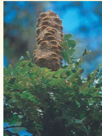
Above: Banksia grandis .

The age of some plants can be estimated from the number of branchings up the stem. The more recent and immature fruits will be located towards the outside of the plant. These should not be collected as the seed will not be ripe. Some species release seed in the absence of fire and seed collection must be timed to ensure that seed is not missed. Other species retain their follicles closed until fire or death causes them to open. Before collecting cones check for signs of predation by stem boring insects, although in many cases it is very difficult to determine whether fruits are predated until seed extraction occurs. Parrots cause severe damage to flowers and cones in their search for these insects.