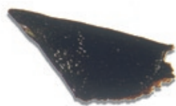
Above: Seed of Banksia laevigata .

After extraction from the cone, Banksia seed is highly germinable without pre-treatment and should germinate in a matter of weeks after sowing. Place the seed directly in the soil, or alternatively germinate the seed in small dishes on filter paper or vermiculite and then pot on. There are a few species from the alpine high country of the eastern states that benefit from cold stratification (placing into a fridge) prior to sowing. This pre-treatment helps the germination as these species naturally experience cold to very cold temperatures over winter (even snow), with spring regeneration. These are not Western Australian species. Seedlings of some species are prone to damping off like many seedlings in the family Proteaceae, so be careful not to over water them.