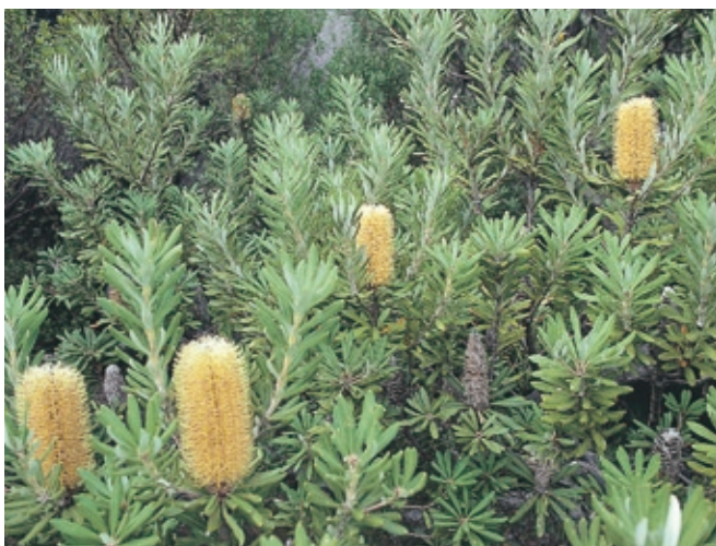
Banksia verticillata .