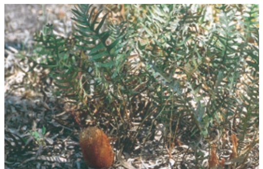
Above: Underdeveloped Banksia flower. Above (centre and right): Prostrate Banksia species.