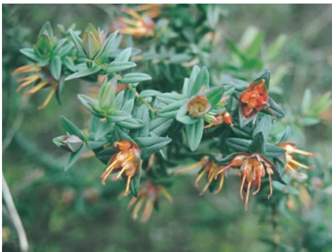
Above: Darwinia citriodora.