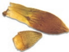
Chamelaucium aorocladus seed and fruit.