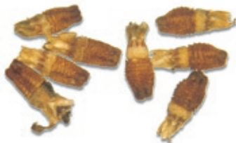
Darwinia acerosa . Fruit on right swollen and holding seed; fruit on left shrivelled with aborted seed.