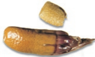
Darwinia collina seed dissected from fruit (above) and whole fruit (below).

It is very difficult to determine from a cursory visual assessment whether or not a seed has formed within the fruits of Darwinia , Chamelaucium or Verticordia . Seed set is often low, particularly in Verticordia . To determine whether seed has set, it is necessary to perform a cut test on a representative sample of fruit. Simply dissect the fruit with a scalpel blade. If you wish to keep the seed for germinating then care is needed not to damage any seed found. It is preferable to use a microscope for this job. Seed needs to be white, firm and translucent for it to be considered healthy and potentially viable. In Darwinia and Chamelaucium , it is far easier to determine whether seed has formed within the fruit. The fruit will be slightly swollen at the base and in the case of the latter, it may be glossy and not shrivelled.