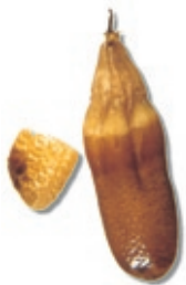
Darwinia leiostyla seed and fruit.