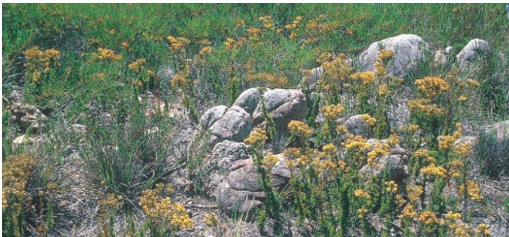
Top left: Chamelaucium sp. Gingin. Top right: Verticordia aurea. Above: Verticordia endlicheriana var. angustifolia.