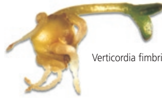
Verticordia fimbriolepis .