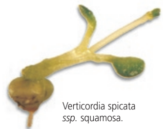
Verticordia spicata ssp. squamosa .