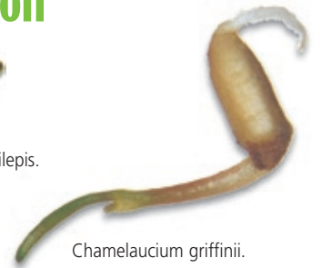
Chamelaucium griffinii .