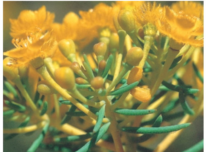
Above: Verticordia aurea. Below: Verticordia fragrans.

The three genera, Chamelaucium , Darwinia and Verticordia form part of the tribe Chamelaucieae belonging to the Chamelaucium alliance of the family Myrtaceae. They share many distinctive characteristics and will be treated in this publication as a group. The genus Darwinia was named after Dr Erasmus Darwin, the grandfather of the naturalist Charles Darwin. The meaning of the name Chamelaucium is not very clear, although in Greek, chamai means dwarf or on the ground and leucos means white. Verticordia was named after the Roman goddess Venus due to the beauty of the flowers.