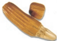
Darwinia oxylepis seed and fruit.