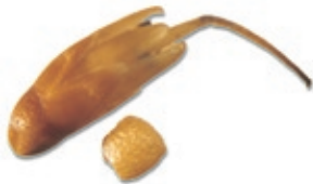
Darwinia chapmaniana seed and fruit.