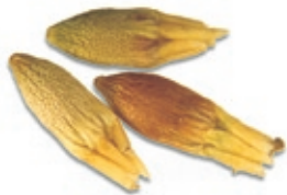
Whole fruits of Chamelaucium aorocladus ; central right fruit coloured and plump indicating good seed.