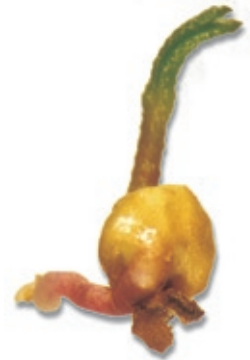
Verticordia staminosa ssp. cylindracea .

Species in all three genera are considered difficult to grow from seed. Plants have traditionally been propagated by cuttings. It is likely that seed dormancy in Verticordia , Darwinia and Chamelaucium is influenced by a complex interaction of factors. The breakdown of seed dormancy and the transition of dormant seed to germinable seed appears to require not only the removal of the seed coat, which acts as a barrier to water uptake, but also the addition of growth hormones to overcome an after-ripening requirement. It is possible that the hypanthium (floral tube) and perianth (sepals and petals of a flower) might help protect the seed from weathering, thus maintaining dormancy. Dormancy breaks down naturally over time because of weathering and soil disturbance. Many species in these three genera appear to have a strong reliance on fire to stimulate germination, indicating heat and/or smoke may help alleviate dormancy in seeds. Recent research has demonstrated smoke responsiveness for some species. Naked seed from the cut test mentioned under Seed Quality Assessment can be grown in the jelly-like substance agar, or put into small dishes with filter paper and kept moist. Some seed will germinate after several weeks. If access to the growth hormone gibberellic acid is available then additions of this to the agar or filter paper at 25 mg per litre will greatly assist germination.