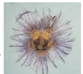
Single flower of Verticordia carinata .

Most species in the Chamelaucium alliance are likely to be pollinated by either specialised or unspecialised insects, and may include native bees and wasps. Darwinia species that have a confluence surrounded by bracts may possibly be bird-pollinated whereas most other members of the genus are thought to be insect-pollinated. It has been postulated that Verticordia grandis may be bird pollinated due to the flower structure. Apparent pollinator mutualisms also have been reported for some other species of Verticordia . Profuse flowering in some species indicates intense competition for pollinators. Honey eating birds are frequent visitors to the flowers of all three genera.