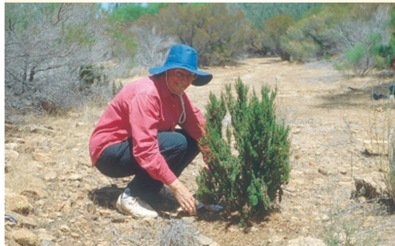
Above: Collecting seed of the rare Verticordia staminosa ssp. cylindracea var. erecta .

Species in the Chamelaucium alliance have indehiscent fruits, or nuts, that usually contain only one seed and are shed annually. They are never discharged but the entire flower dries and breaks off below the receptacle. Seed must be collected when mature and timing of collections is important. It is possible to collect seed of each of the three genera from below plants but insect predation may be higher in such collections. Old flowers of Verticordia form the fruit and hence old faded flowers are collected when they easily come off the plant. Both Darwinia and Chamelaucium form fruits that appear different from the flowers and turn brown and leathery to hard when ripe. For most species in the three genera several months from the beginning of flower initiation to seed collection are needed. Most Darwinia and Chamelaucium are spring flowering with summer fruiting, whereas Verticordia may be either spring or summer flowering and seed is ripe for collecting mid summer.