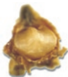
Verticordia albida partially dissected flower revealing seed.