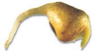
Chamelaucium uncinatum .