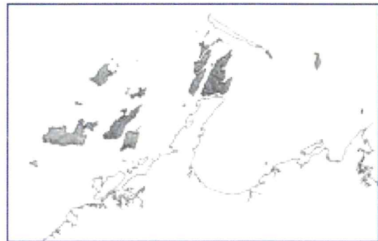
Dampier Archipelago nature reserves and recreation reserves managed by CALM