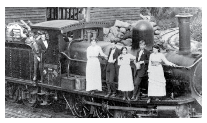
'The Blackwood' locomotive

waterways. St John Brook is believed to have been a travel route for Nyoongars as they moved from the coastal lowlands at the end of the warmer months to the open woodlands inland as water spread across coastal areas. It is believed that Nannup, only eight kilometres from the park, means 'A place to stop and rest'.