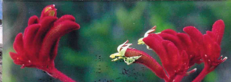
Above Kangaroo paw ( Anigozanthos rufus).