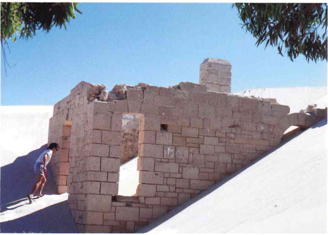
Below Old telegraph station, near Eucla National Park.

Near the western boundary of the park, the ruins of the Eucla Telegraph Station and original Eucla township can be found, gradually being buried by encroaching sand dunes. These ruins date from the construction of the original transcontinental telegraph line. Ask DEC staff for details.