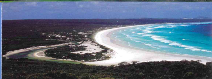
Above Thomas River and Yokinup Bay.

Below Tagon Beach, Cape Arid National Park.