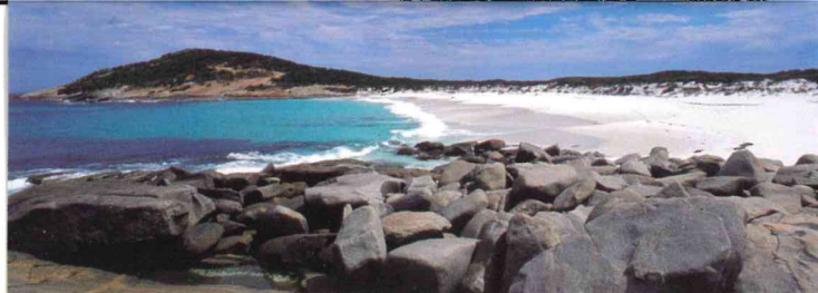
Above Little Tagon Bay, Cape Arid National Park.