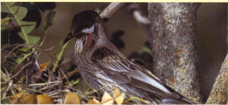
Below Red wattlebird ( Anthochaera carunculata ).

Huge waves and swells can suddenly occur even on calm days. Rocks become slippery when wet. Riptides are common along the coastline.