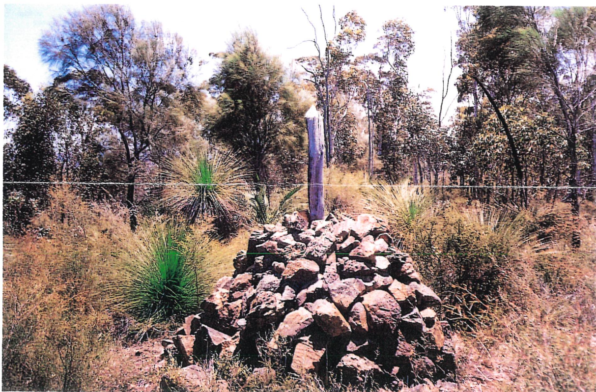
Original cairn and pole; Avon Valley Triangulation survey 1878.

This trail acknowledges Forrest's efforts to complete the 1877-78 survey by showing you the difficult terrain which had to be overcome and the rock cairns he placed at sites PV, SH as part of the survey.