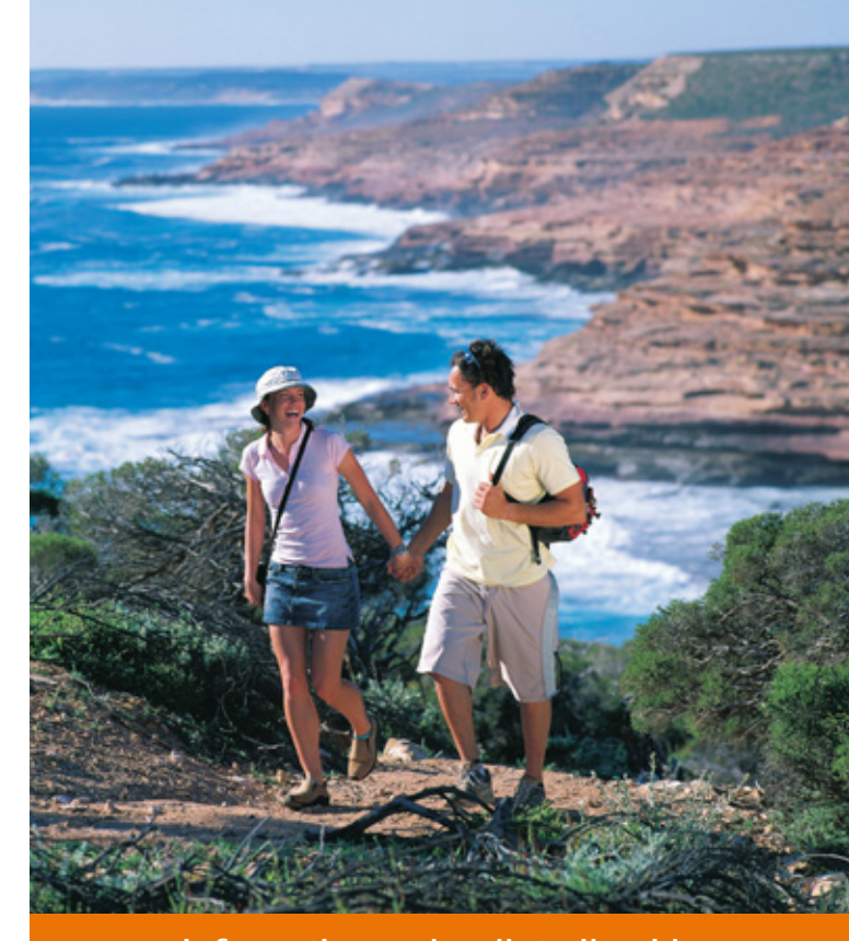
Information and walk trail guide