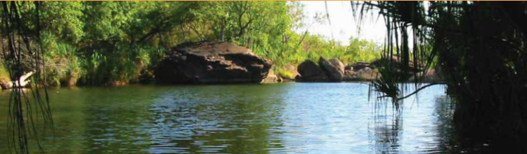
Below Swimming hole at Little Mertens.

When walking in the park, wear sturdy footwear and a hat, and use sunscreen. Walk with at least two other people and carry plenty of water (4L per person per day). Walking is more pleasant during the morning and late afternoon when it is cooler. For your own safety, please remain on existing trails.