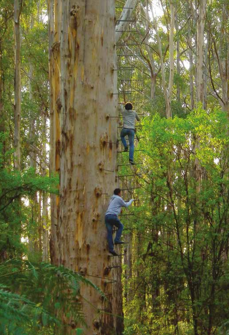
Dave Evans Bicentennial Tree

The arboretum is 3km from Big Brook Dam by vehicle, or 1km on foot via a walk trail that leads off from the upper reaches of the dam. You can wander among the many plots of exotic trees that were planted here and see how they grow and respond to the local soil and climate.