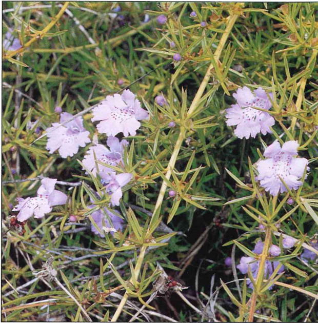
Above: Snake Bush ( Hemiandra pungens ).

Forming unique vegetation associations within the dune system, the flora of the Port Kennedy Scientific Park has high conservation values. It contains many species typical of coastal areas including heathlands, acacia thickets, paperbark swamps and balga belts. The greatest number of species and density of growth occurs within the swales between the dunes.