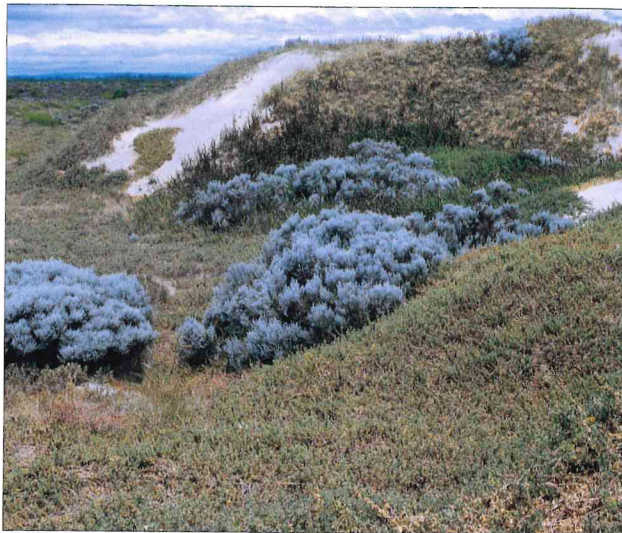
Foredune and swale

The Port Kennedy Scientific Park, nine kilometres south of Rockingham, is an A-class nature reserve that forms part of Rockingham Lakes Regional Park. This attractive coastal area covers internationally important dune systems. Each dune system forms part of an evolutionary time sequence, and supports examples of a threatened plant community. It is envisaged that the Scientific Park will become a 'living laboratory' for students of nature-based science.