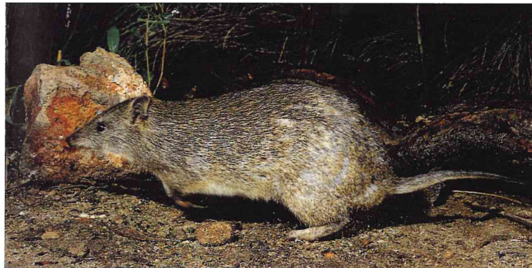
Top left: Western black-striped snake ( Neelaps calonotus ).