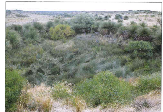
Sedgeland fringed by balgas.

Dampland and sumpland areas at Port Kennedy are generally narrow and linear, or circular, with mosaics of sedgeland vegetation that reflect localised soil moisture and soil types. Sedges, such as knotted club-rush ( Isolepis nodosa ), coastal sword-sedge ( Lepidosperma gladiatum ), bare twig-rush ( Baumea juncea ), searush ( Juncus kraussii ) and jointed twig-rush ( Baumea articulata ), typify these wetlands. Dense and attractive stands of balga ( Xanthorrhoea preissii ) or swamp paperbark ( Melaleuca raphiophylla ) may fringe the sedgelands.