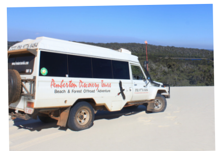
Pemberton Discovery Tours

Climbing – 65m up the Dave Evans Bicentennial Tree to get a 360-degree view of the karri forest and out to the coast. A truly rewarding experience!