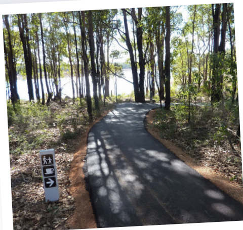
Logue Brook Dam, Dwellingup State Forest

Adventure four-wheel driving, fishing, surfing, bushwalking