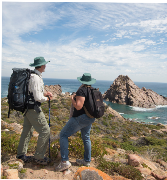
Cape to Cape Track

Bushwalking – part of the Cape to Cape Track