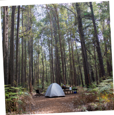
Lane Poole Reserve

School holidays, long weekends and Easter are popular times to go camping. Most campgrounds cannot be booked, and the chances of securing a camp site with a group will be challenging at these times. We suggest camping with a small group outside of peak periods and remember to always have an alternative campground choice, just in case.