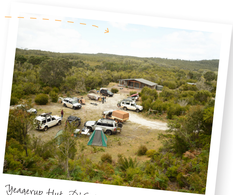
Yeagerup Hut, D'Entrecasteaux National Park

Enquiries and bookings: Phone 0427 133 335 email info@pembertondiscoverytours.com.au www.pembertondiscoverytours.com.au