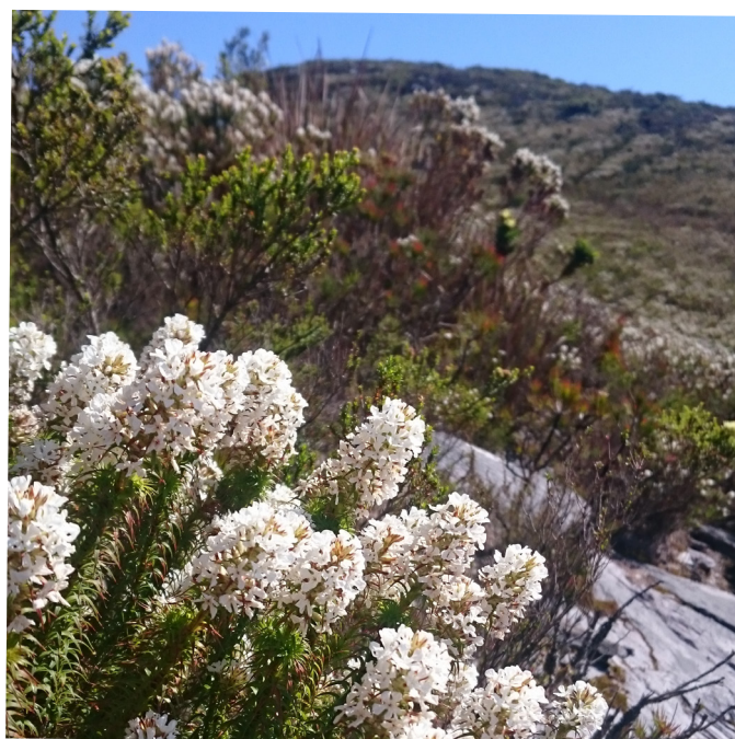
Bluff Knoll, Stirling Range National Park

Boating, waterskiing, bushwalking, picnicking, canoe or kayaking