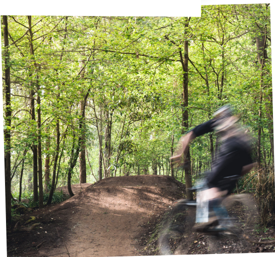
Mountain biking in Bramley National Park