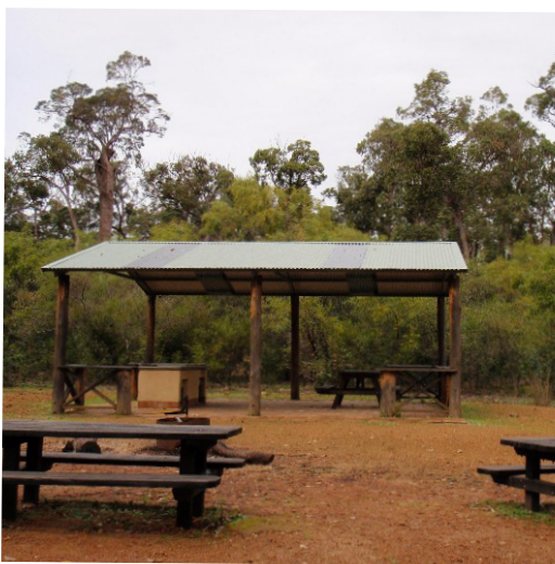
Warner Glen, Blackwood River National Park