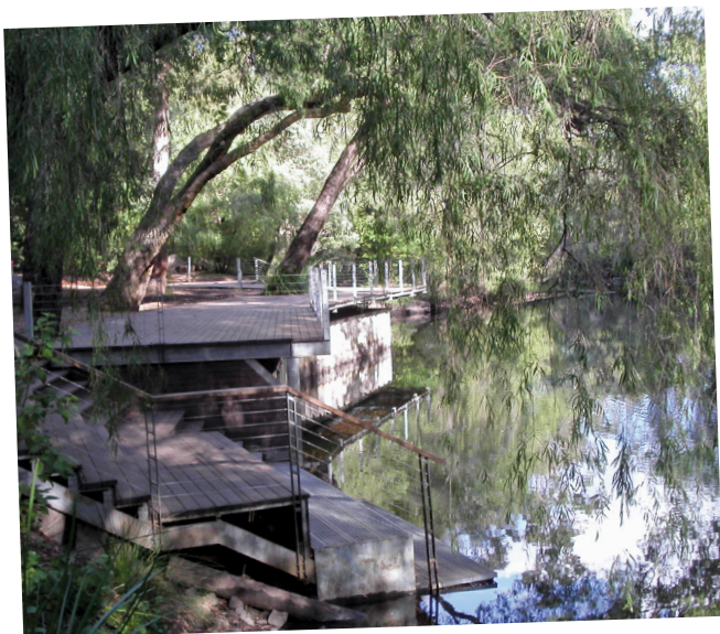
Honeymoon Pool, Wellington National Park

Mountain biking - hit the mountain bike trails for an adrenalin rush or simply take in the natural bush setting at your leisure. The kids will love the brand new mountain bike pump track in the campground!