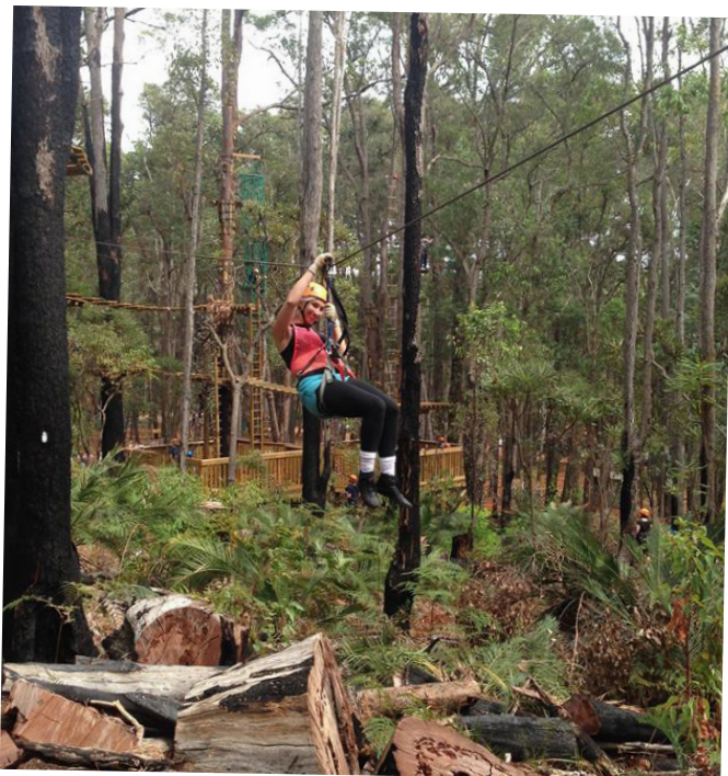
Trees Adventure at Lane Poole

Kayaking, canoeing and rafting – Dwaarlindjirraap is the perfect spot to launch your canoe or kayak. Be mindful of the water conditions as they will vary according to the season