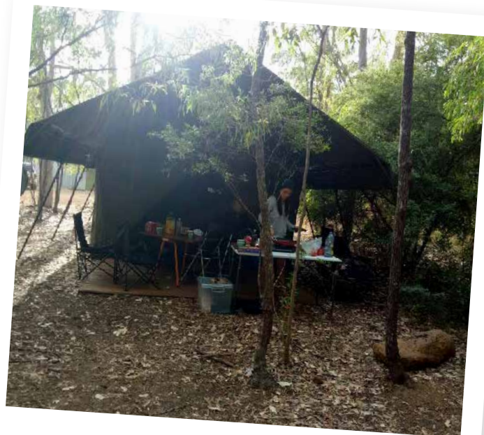
Wharncliffe Mill, Bramley National Park

Try glamping – glamorous camping – and enjoy your camping experience without buying or borrowing a tent. Here's our selection of the best glamping experiences with fully accredited businesses that are licensed to operate in national parks and reserves. Depending on your choice, some businesses can provide all bedding and cooking equipment and others will include meals, activities and the five-star treatment. The choice is yours.