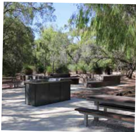
Martins Tank campground