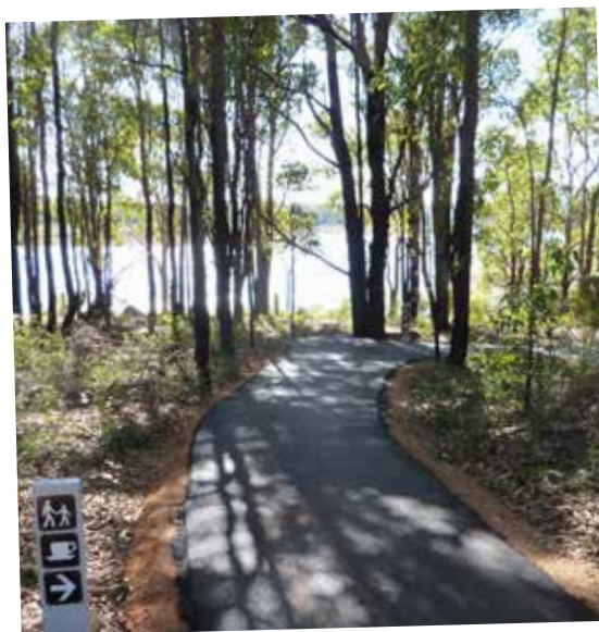
Logue Brook, Dwellingup State Forest

Mountain biking – the Munda Biddi Trail can be accessed from The Dell.