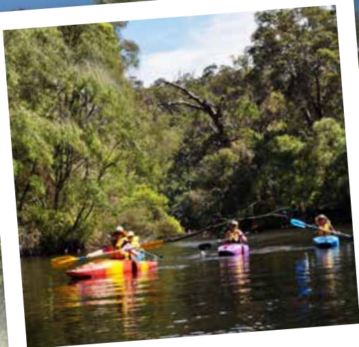
Warren River, Warren National Park