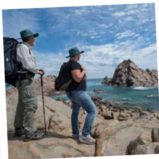
Cape to Cape Track

Bookings essential: parkstay.dpaw.wa.gov.au