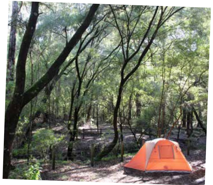
Wellington National Park

Camping around the month of November? Join Pemberton Discovery Tours annual beach cleanup as they travel to the coast from Pemberton by four-wheel drive either as tag along or onboard their vehicle. It is a great way to meet like-minded people!