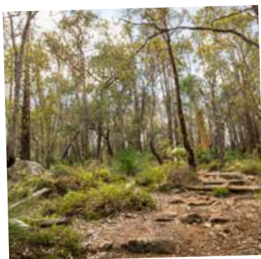
Beelu National Park

↑ Check out the panoramic views over Lake C.Y. O'Connor, Mundaring Weir and Helena River Valley from nearby South Ledge.