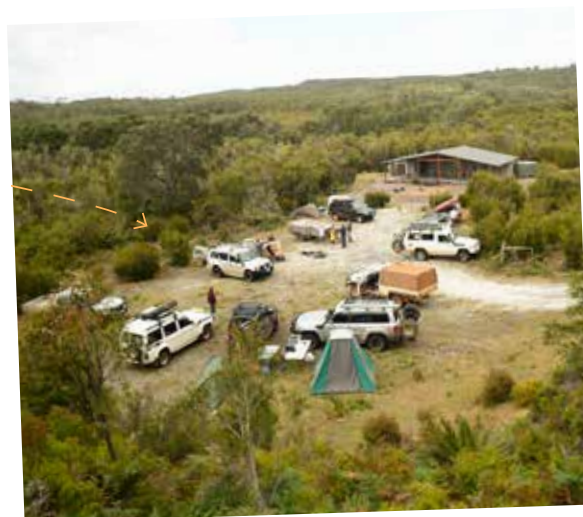
Yeagarup Hut, D'Entrecasteaux National Park

Enquiries and bookings: Phone 0427 133 335 email info@pembertondiscoverytours.com.au www.pembertondiscoverytours.com.au