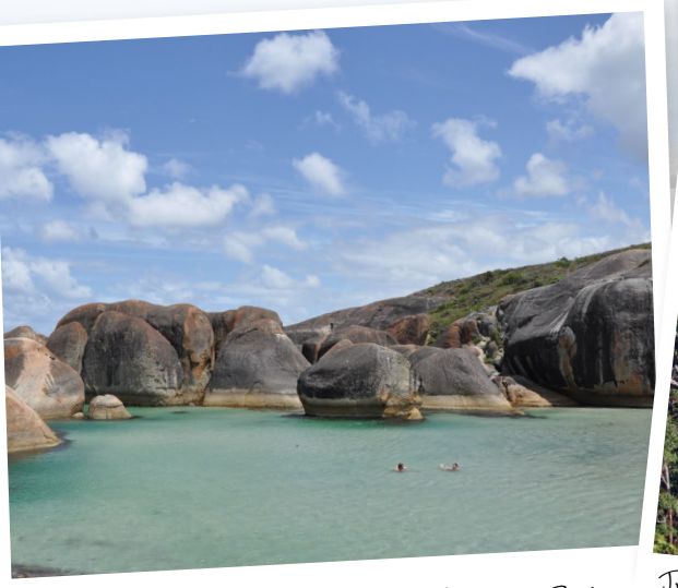
Greens Pool, William Bay National Park

Canoe, fish or snorkel at the inlet at Walpole-Nornalup National Park or simply take in the stunning scenery of pristine forest and tannin rich rivers. Take the time to meander along the 500m forest sculpture loop at Swarbrick.