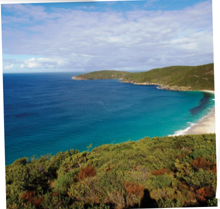
Shelley Beach, West Cape Howe National Park

Denmark is a great spot to join the 1000km Munda Biddi Trail, Western Australia's, world class, nature based, off-road cycling trail.