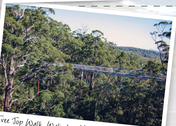
Tree Top Walk, Walpole-Nornalup National Park

29km north of Walpole is beautiful Mount Frankland National Park – the perfect spot to enjoy a barbecue or picnic in the forest before exploring one of the various walk trails on offer. Mount Frankland provides spectacular views from the Mount Frankland Wilderness Lookout or climb to the peak for a birds-eye view of the forest and valleys below.