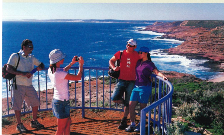
Cover image: The Gap, Torndirrup National Park. Above: Kalbarri National Park.

All fees in this brochure may be subject to change without notice. All fees collected are retained by the department to assist in conservation and park management, including the improvement of visitor services and facilities.