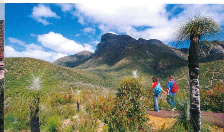
Above: Stirling Range National Park.