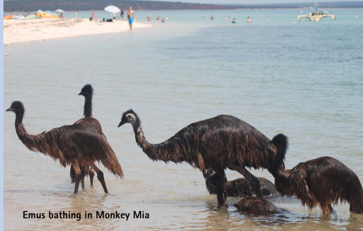
Emus bathing in Monkey Mia

Also noted in the World Heritage values of Shark Bay is the huge number of humpback whales visiting the bay during their southward migration in spring.