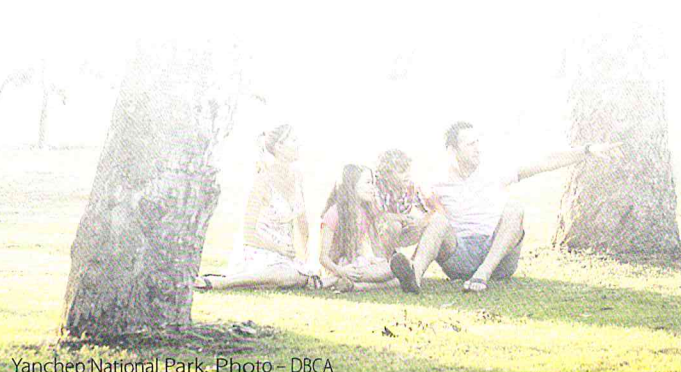
Yanchep National Park.