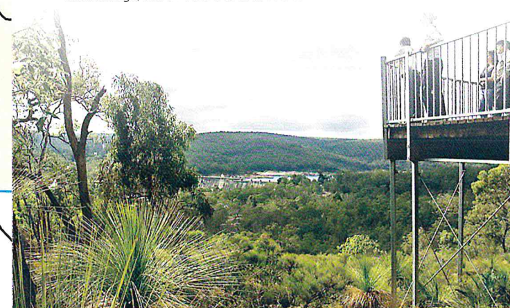
South Ledge, Beelu National Park.

About 100km south of Perth near Dwellingup, Lane Poole Reserve has picnic areas and river access for canoeing and kayaking. You can also book to stay overnight in one of the campgrounds.