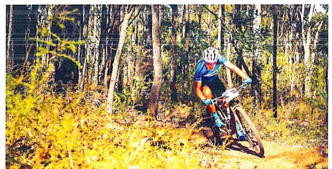
Mountain biking photos courtesy of MTBGuidebook.com

All trails will be designed and built using the Western Australian Mountain Bike Guidelines, coordinated by the Parks and Wildlife Service. The guidelines inform the process and include necessary approvals and checklists for management of flora, fauna, Aboriginal and other heritage considerations and issues such as weeds, pest and dieback. The department's Disturbance Approval System comprehensively assesses any and all values that need to be protected.