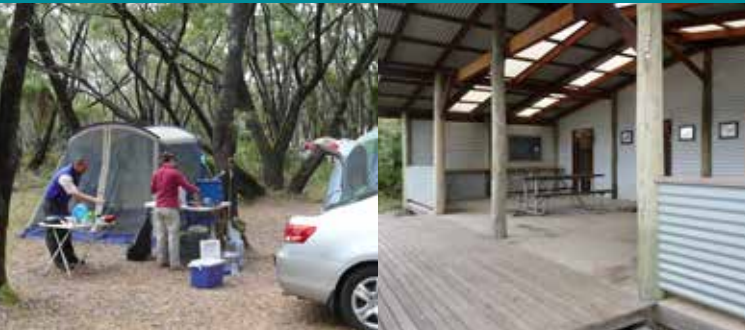
Above Crystal Springs campsite Above right Banksia Hut at Banksia Camp