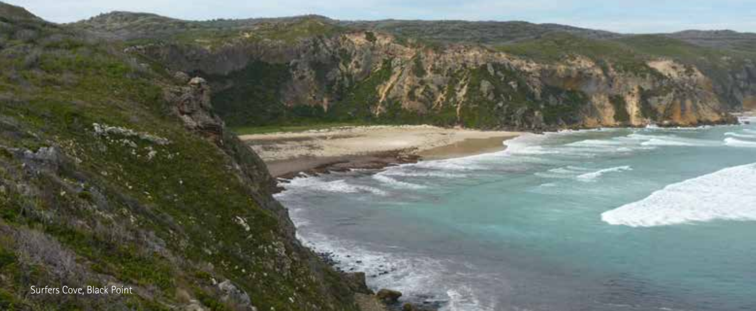
Surfers Cove, Black Point

Fatalities have occurred in D'Entrecasteaux National Park. Remember, your safety is our concern but your responsibility.