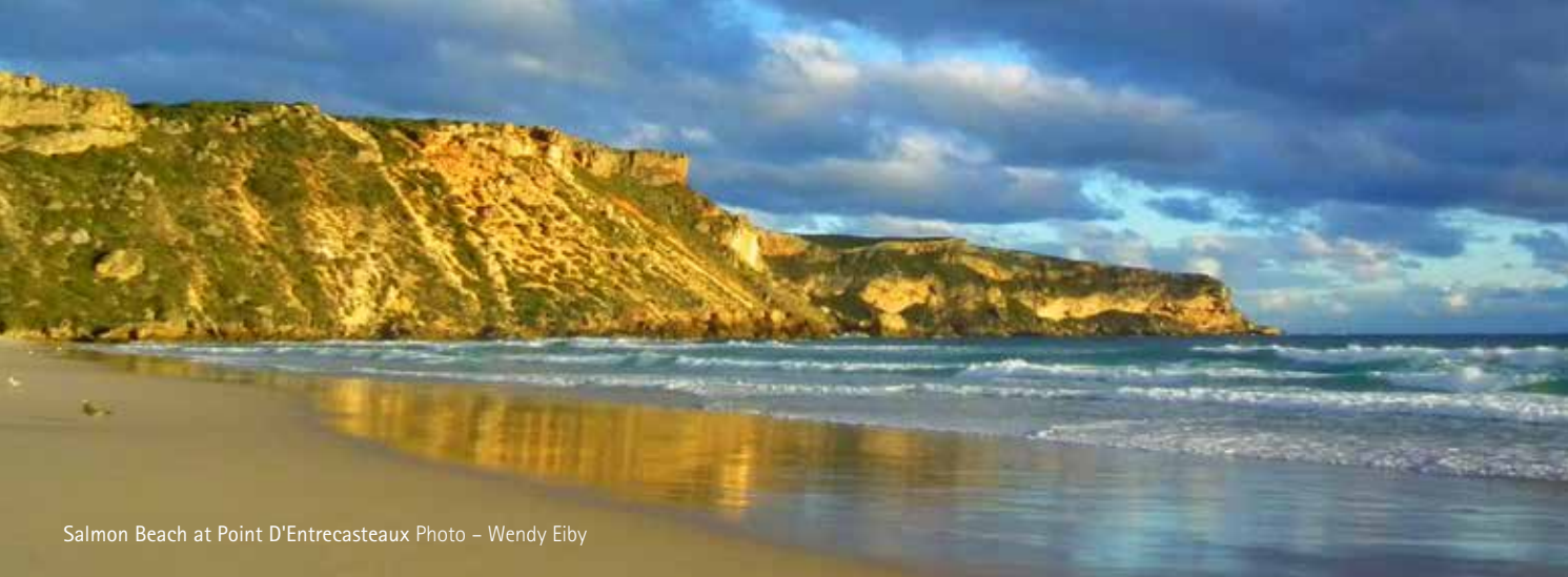
Salmon Beach at Point D'Entrecasteaux