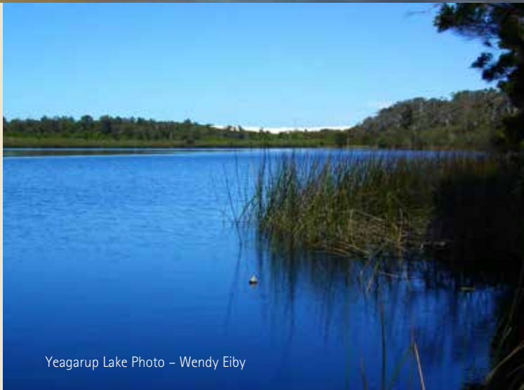
Yeagarup Lake

There are 30 campsites tucked into the peppermint trees at Black Point. It's a great place to base yourself to explore this coastline.