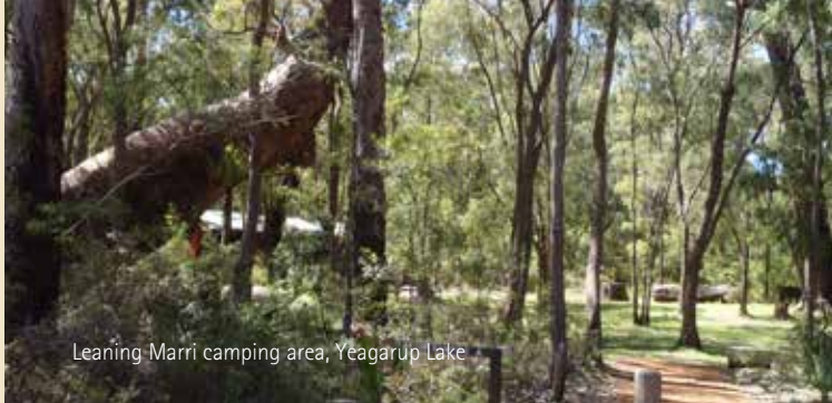
Leaning-Marri camping area, Yeagarup Lake

There are three walk-in camp sites at Lake Jasper and they are regularly full in the warmer months. Black Point and Carey Brook offer camping nearby if Lake Jasper is full.