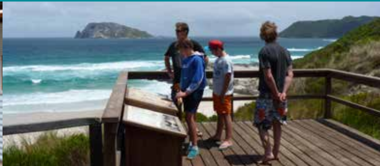
Above Mandalay Beach lookout