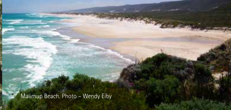
Malimup Beach.

Jasper, Yeagarup, Warren, Malimup, Gardner, Coodamurrup