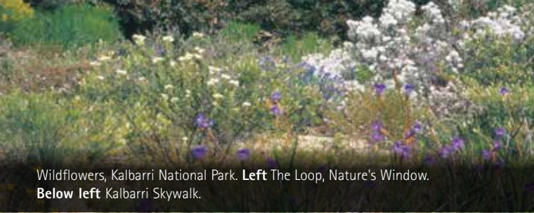
Wildflowers, Kalbarri National Park. Left The Loop, Nature's Window. Below left Kalbarri Skywalk.