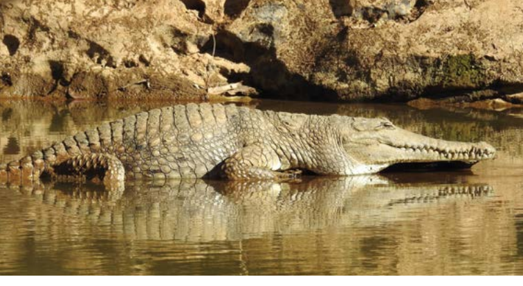
Above Freshwater crocodile.