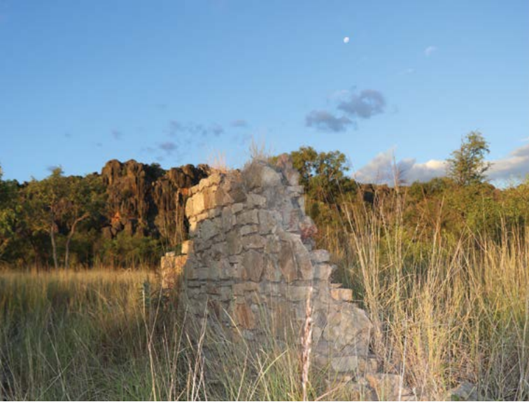
Above Image caption. Photo - credit name