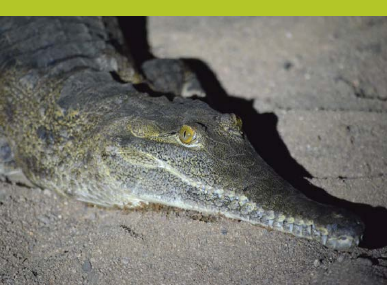
Above Freshwater crocodile.