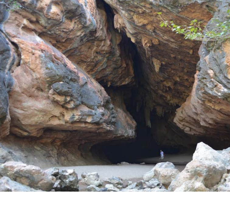
Above Dimalurru (Tunnel Creek).