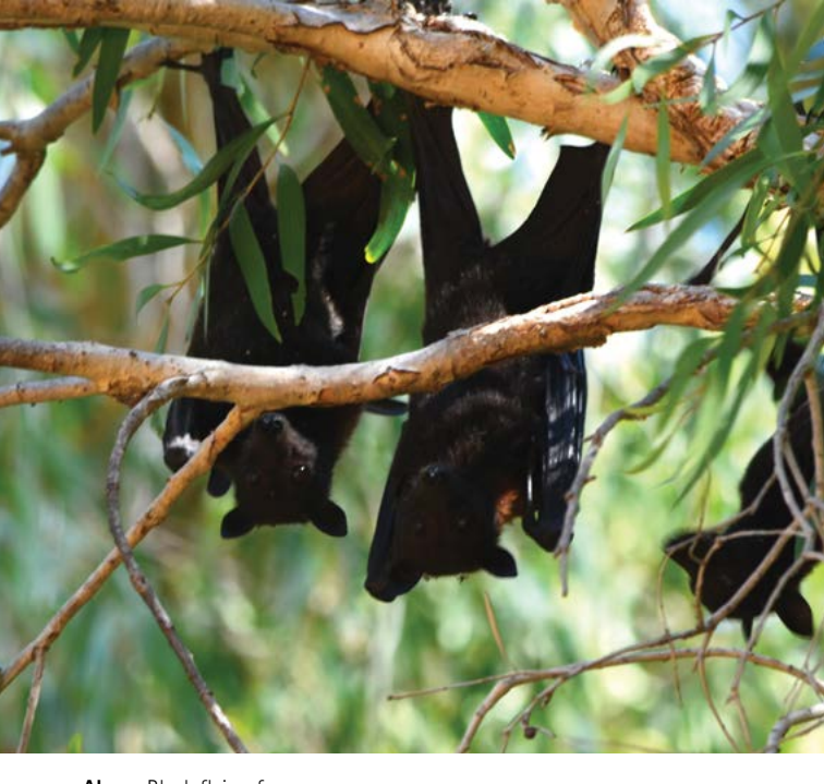
Above Black flying fox.