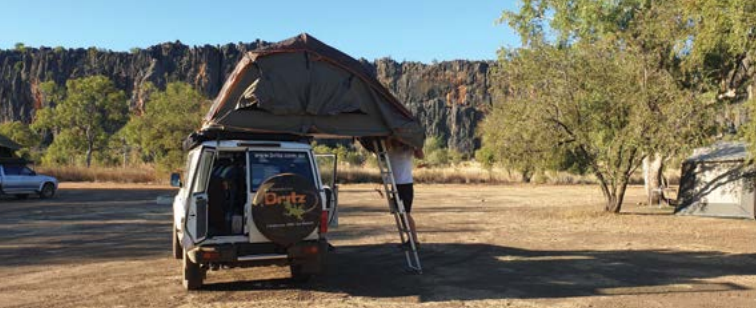
Above Bandilngan (Windjana Gorge) campsite.