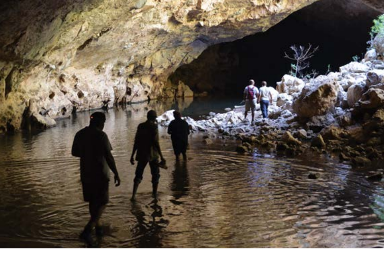
Above Dimalurru (Tunnel Creek).