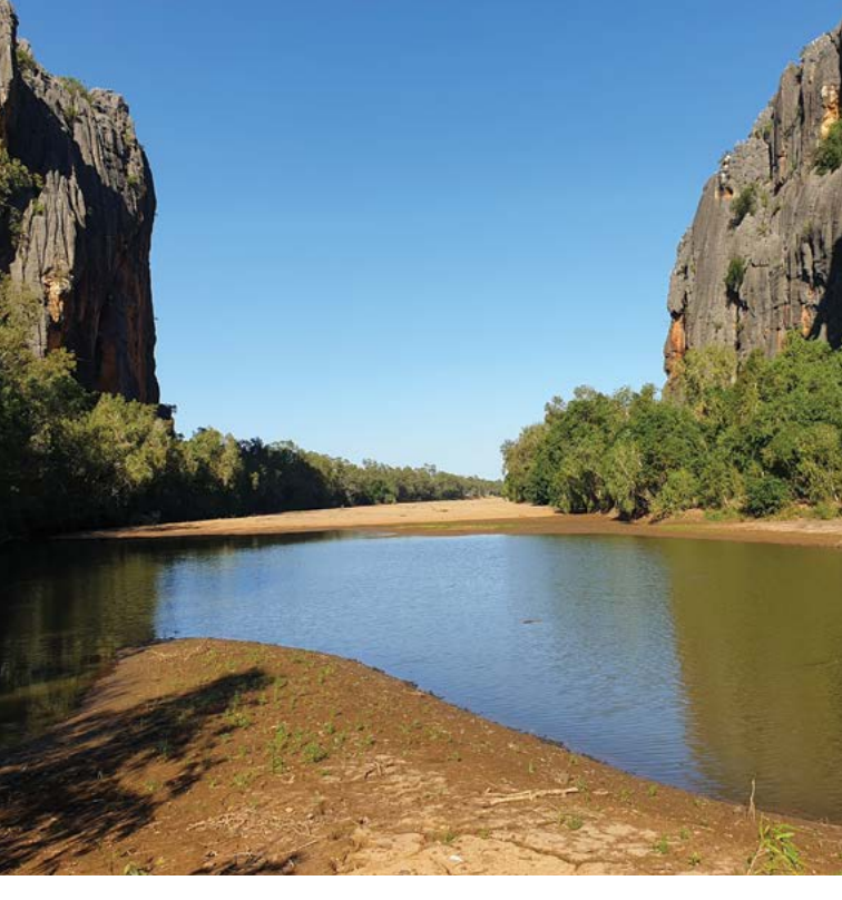
Front cover Bandil<u>ng</u>an (Windjana Gorge). Above Bandilngan (Windjana Gorge).