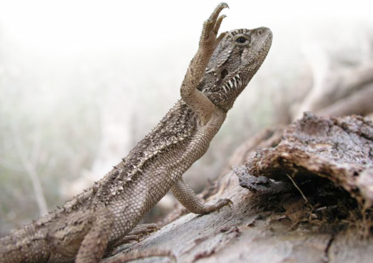
Above Western bearded dragon.