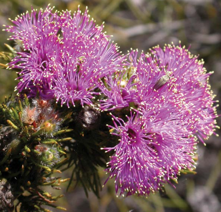
Above Eremaea violacea.