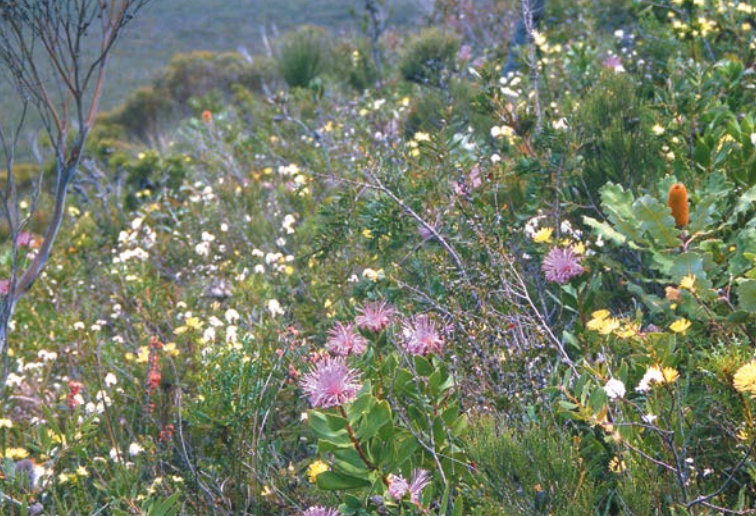
Above Wildflowers.