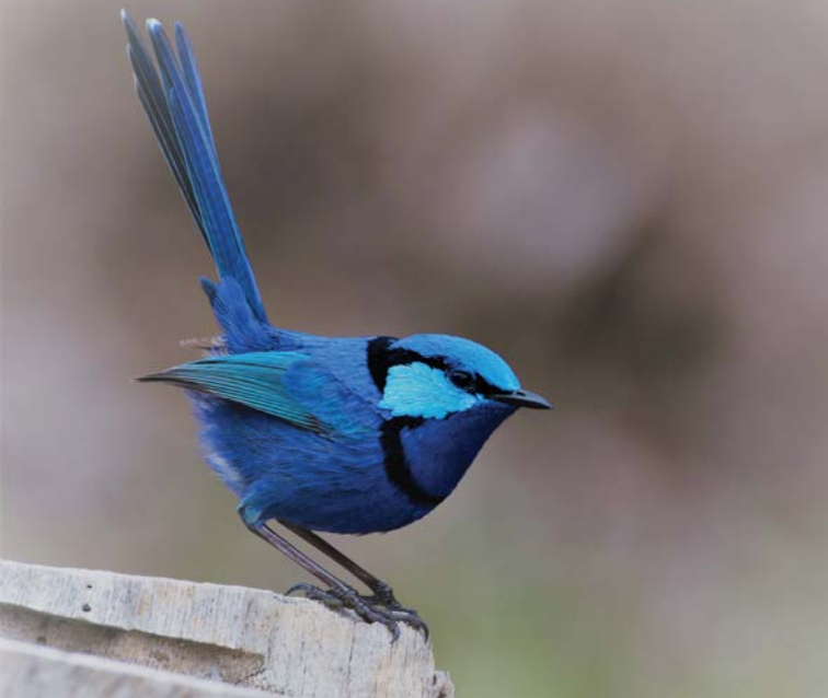
Above Splendid fairy-wren.