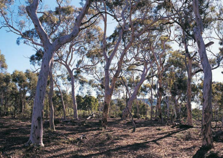
Above Wandoo woodlands.