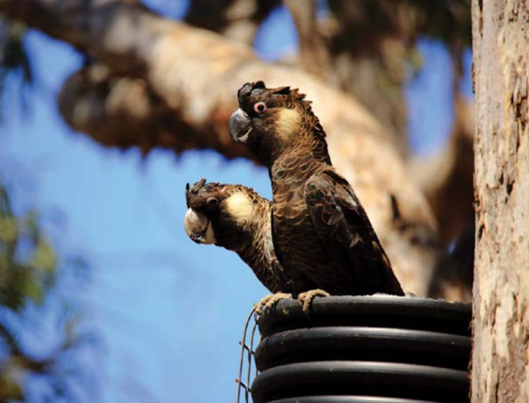
Above Carnaby's cockatoo.