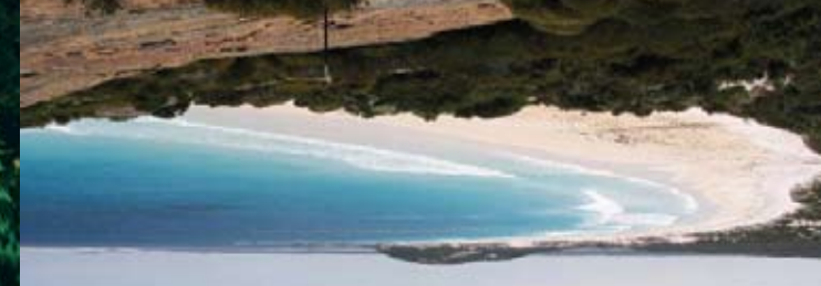
Below Tagon Beach, Cape Arid National Park.

Below Mount Ragged, Cape Arid National Park.