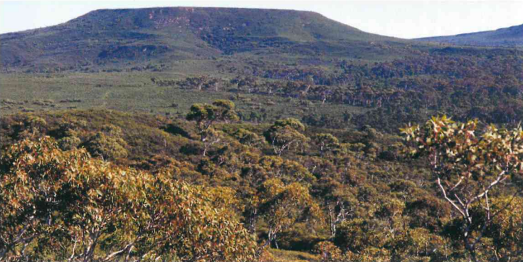
Above Mount Lesueur.