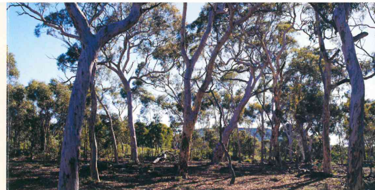
Above Wandoo woodlands.