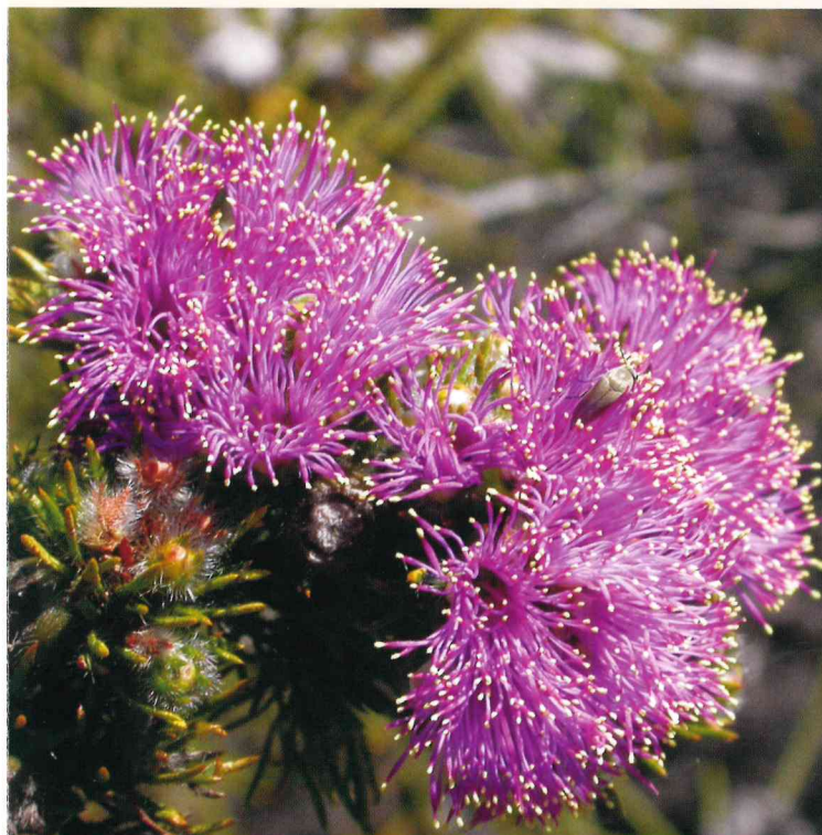
Below Eremaea violacea .

The park conserves a variety of vegetation types. The exceptionally diverse low heath, referred to as kwongan by Aboriginal people, covers a large portion of the park. Creek lines and low areas are filled with woodlands of wandoo, marri and banksia. Lesueur National Park is a biodiversity hotspot and ranks as one of the most important reserves for flora conservation in Western Australia.