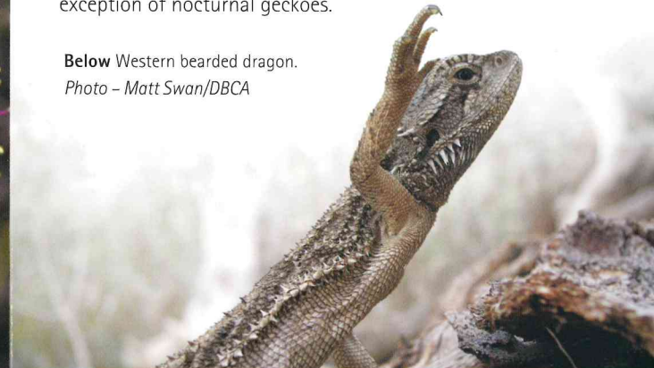
Below Western bearded dragon.

Reptiles are generally most active during the day, with the exception of nocturnal geckoes.