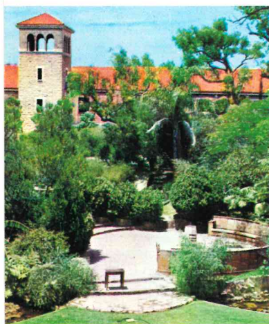
University Sunken Gardens

Hyde Park, a mile north of the city, comprises 38 acres of expansive lawns, shaded by magnificent deciduous trees. This park highlights the warm and rich colourings of autumn. An ornamental lake and island in the centre is the haunt of wild fowl.