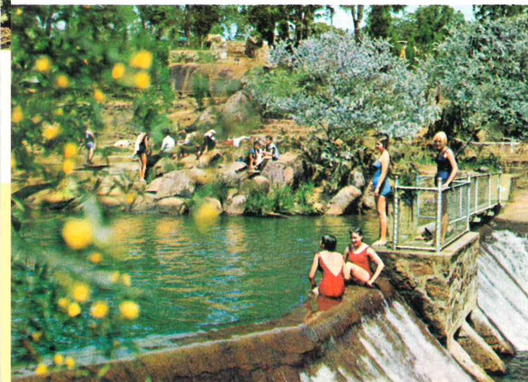
National Park swimming pool

Serpentine Dam has been delightfully landscaped to fit into the natural beauty of the site. Western Australian wildflowers and shrubs are combined with exotic plants to provide a colourful panorama.