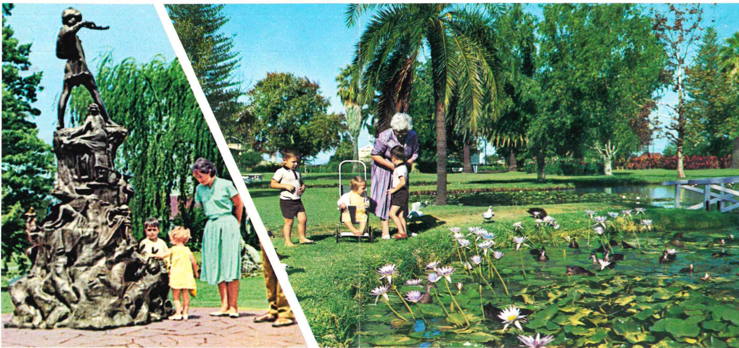
Peter Pan statue