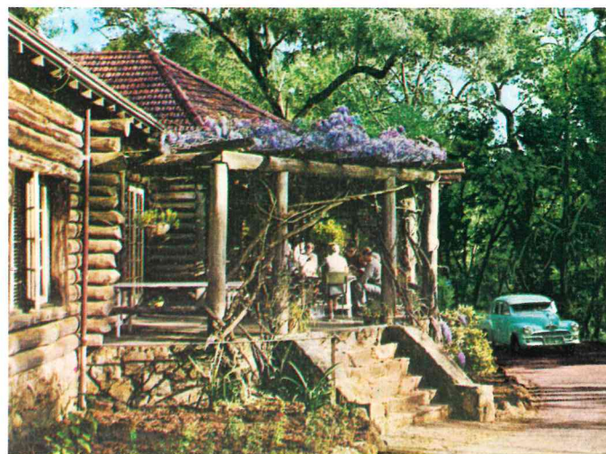
The Chalet at Araluen

Nestling among the hills near Perth is Araluen, hills headquarters of the Young Australia League. Through an impressive pergola, visitors enter and pass to Healy Chalet and the swimming pool. The Grove of the Unforgotten, a memorial to members of the Y.A.L. who fell in both wars, is one of the many unusual features of Araluen.