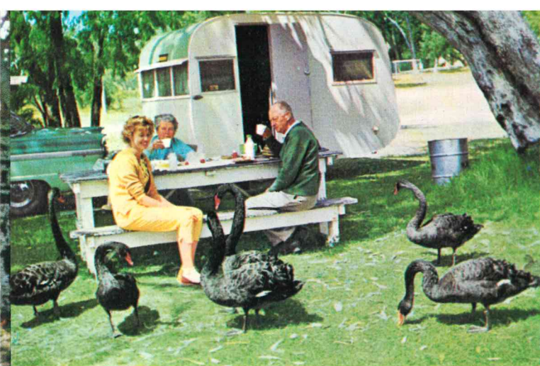
Yanchep Park — A favourite picnic spot.

Yanchep National Park, 32 miles north of Perth, comprises 6660 acres of natural bushland. The park provides full amenities for both the day visitor and the holiday-maker. Accommodation is available at Yanchep Inn, Gloucester Lodge and McNess House.