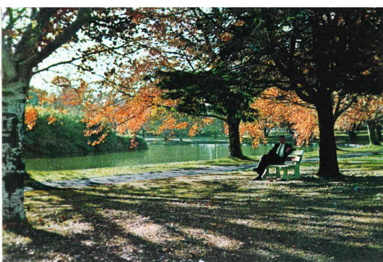
Autumn in Hyde Park

Hyde Park, a mile north of the city, comprises 38 acres of expansive lawns, shaded by magnificent deciduous trees. This park highlights the warm and rich colourings of autumn. An ornamental lake and island in the centre is the haunt of wild fowl.