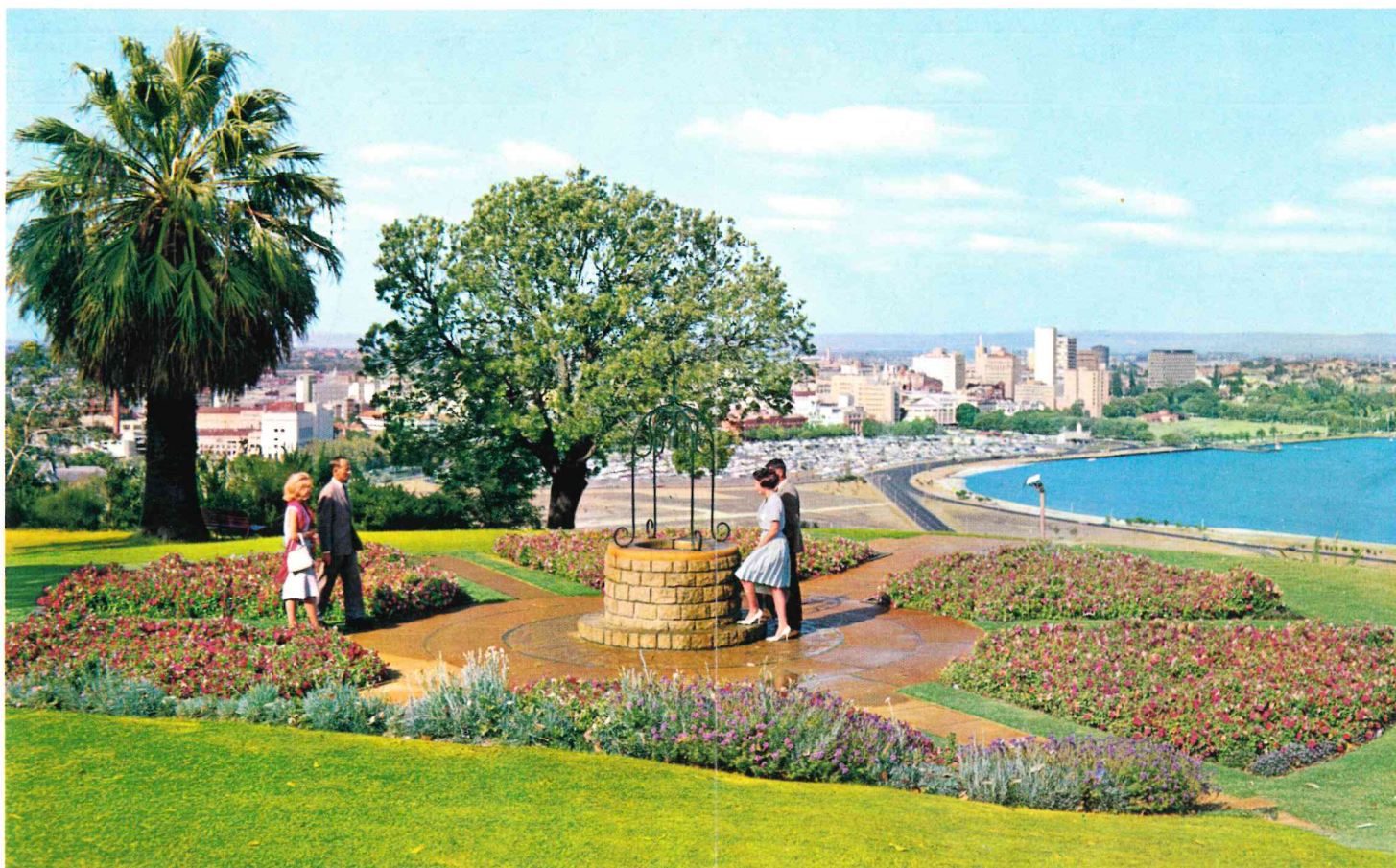
A panorama of Perth from King's Park