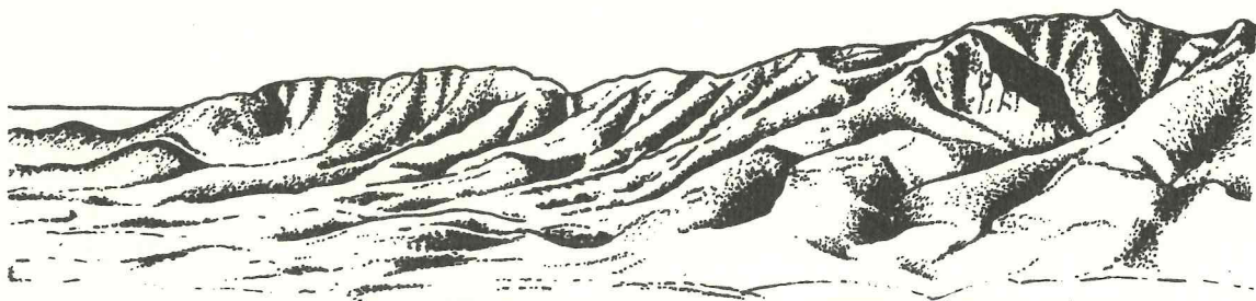
Thumb Peak from Middle Mt Barren