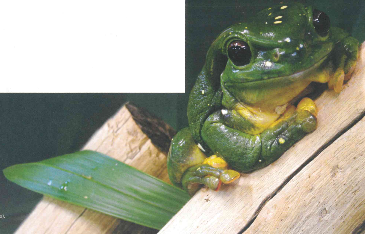
Splendid tree frog ( Litoria splendida ).