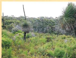
Coastal heath meets forest—Boranup

Department of Conservation and Land Management Busselton Office Tel: (08) 9752 1677 Margaret River Office Tel: (08) 9757 2322 or visit NatureBase at: http://www.naturebase.net