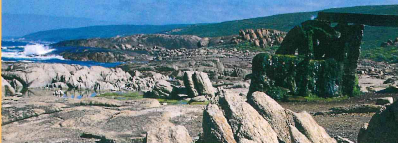
Waterwheel and view north — Cape Leeuwin

Cape to Cape sectional brochures Cape to Cape Friends brochure Complimentary Cape to Cape sticker