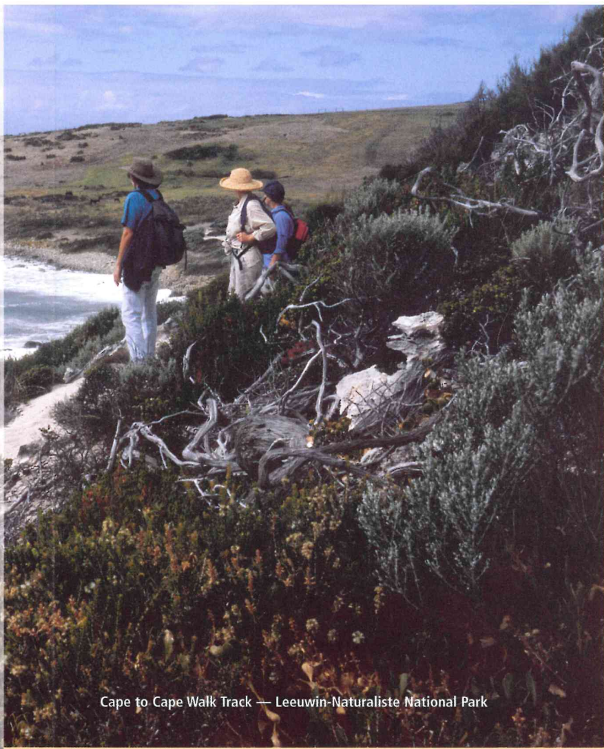
Cape to Cape Walk Track — Leeuwin-Naturaliste National Park