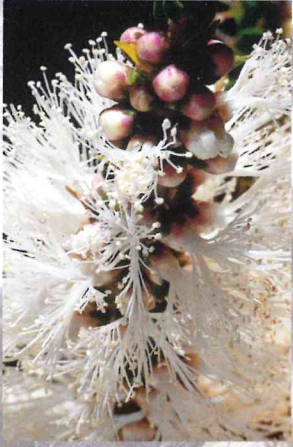
Melaleuca spp huegellii — coastal heath near Hamelin Bay