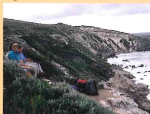
Taking in the scenery