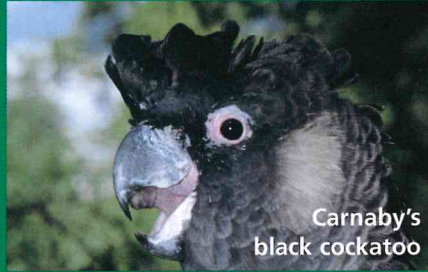
Carnaby's black cockatoo