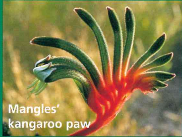
Mangles' kangaroo paw