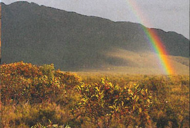
Cape Arid National Park Mt Ragged