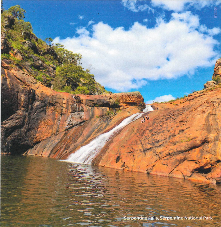
Serpentine Falls, Serpentine National Park