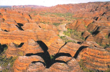
Purnululu National Park Bungle Bungle Range