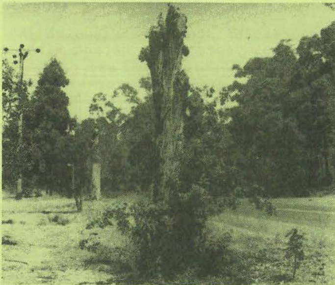
These sad specimens are located in Dwellingup, but you can see similar examples all over the South-West at this time of the year.

Surely, when a tree clashes with technology it would be kinder on the tree (and the eyes of the community) to replace it with a shrubby cousin.