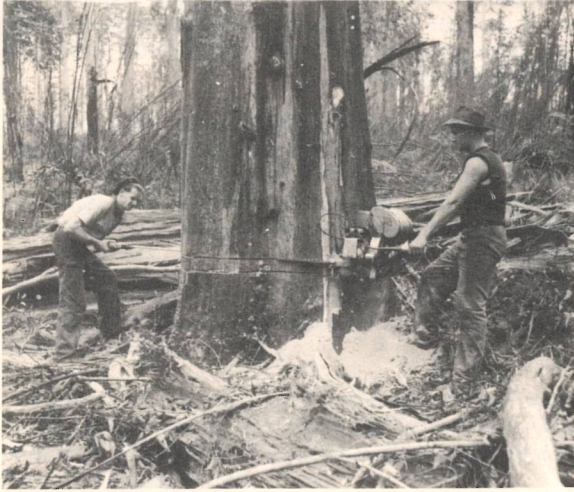
Two-man chain saw

In the late 1940s a new type of saw, that was to revolutionise tree felling and log preparation became available on the Australian market. This was the Chain Saw . Like the power circular saws, they were powered by two-stroke motorcycle engines and the first models were two-man saws about 2 metres long and very heavy. The Teles, Blue Streak and Danarm saws were used for about seven years until the first of the American one-man saws