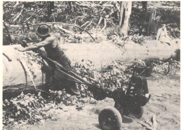
Mobile drag saw

Drag Saws were cross-cut saws cutting in one direction only, and connected by a crank to the fly-wheel.