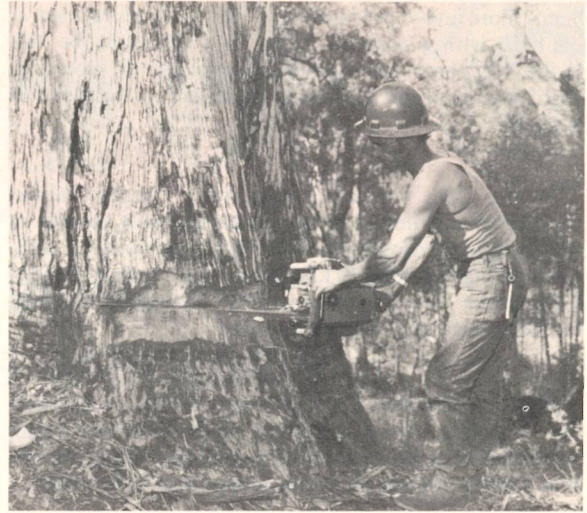
One-man chain saw

arrived in Australia in about 1956. These were still very heavy by modern standards but had specially designed motors and another great innovation—the Chipper Chain.