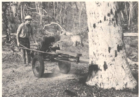
Mobile circular saw