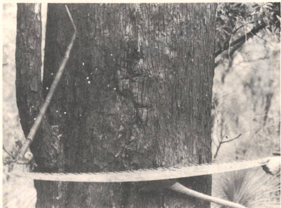
Cross-cut saw with spring

An interesting adaption was for use by one man by attaching a return spring to one side of the tree.