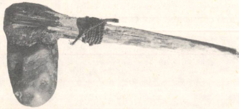
Stone Age axe

Stone age man developed the first primitive knives and stone axes that were used, not only to kill and prepare food, but also to cut down trees for use in his home and for fuel. The stone age axe looked something like this: