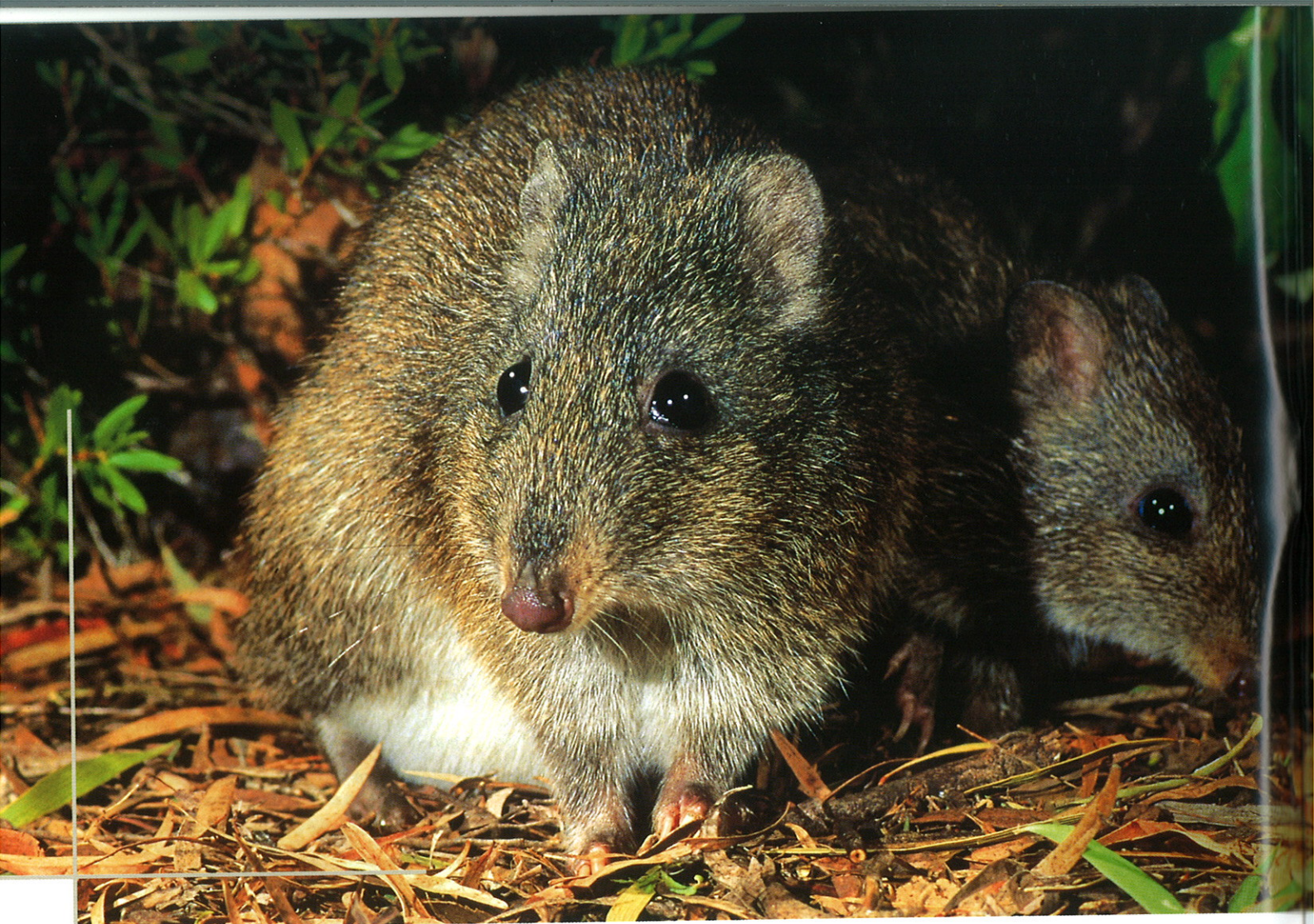
Above Female Gilbert's potoroo with a juvenile.