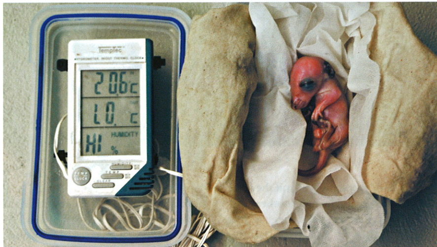
Left A Gilbert's potooro joey in a portable incubator awaiting cross-fostering to a long-nosed potooro surrogate mother.