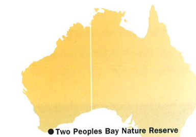
● Two Peoples Bay Nature Reserve

Staff from the then Department of Conservation and Land Management (now Department of Environment and Conservation) also started a program of searches for potoroos along the south coast. The team was later