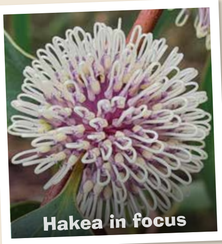
Hakea in focus

Natural distribution From the Perth Hills east to Dragon Rocks Nature Reserve near Hyden