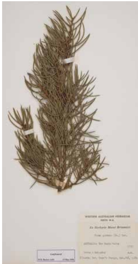
Top left Carnaby's cockatoos ( Zanda latirostris ) on Hakea trifurcata .

Planting some stunning native Hakea species in your garden provides habitat and foraging resources for a variety of species. Hakea flowers produce large