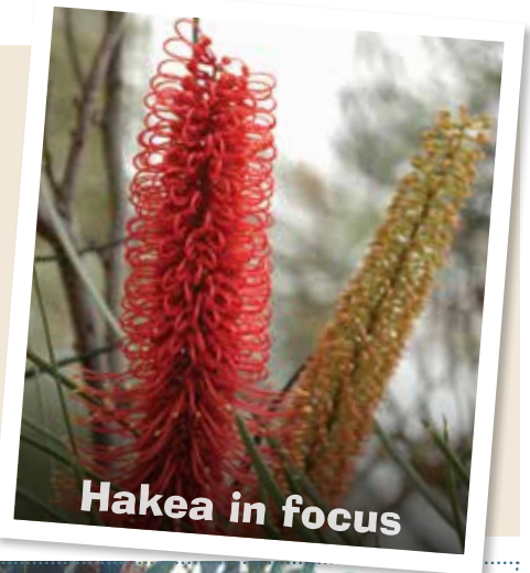
Hakea in focus

Common name Red pokers Height and habit Up to 4.5m, rounded bushy shrub Flower colour Red, elongated raceme (spike) Foliage Narrow linear leaves Soil type Loam or clayey sand Flowers August to September Unique feature Stunning large red inflorescences Natural distribution From just south of Denham in the north to Geraldton in the south