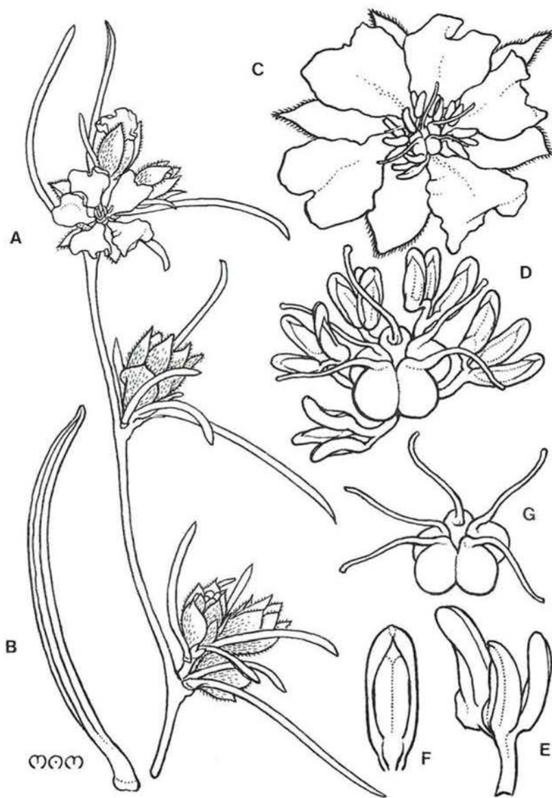
Figure 1. Hibbertia ferruginea A—Habit. B—Leaf. C—Flower. D—Flower with sepals and petals removed, showing the arrangement of stamens and carpels. E—Staminal bundle. F—Anther. G—Carpels.

From A. T. Hotchkiss, Ludlow, 4 Sept. 1953.