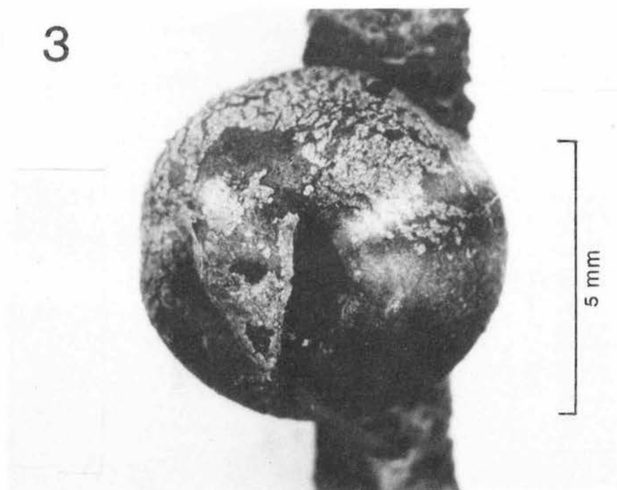
Figure 2. Close-up of a cluster of young fruits of C. accedens (from isotype at PERTH).