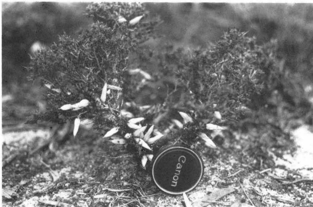
Figure 2. Habit of Bentleya spinescens .