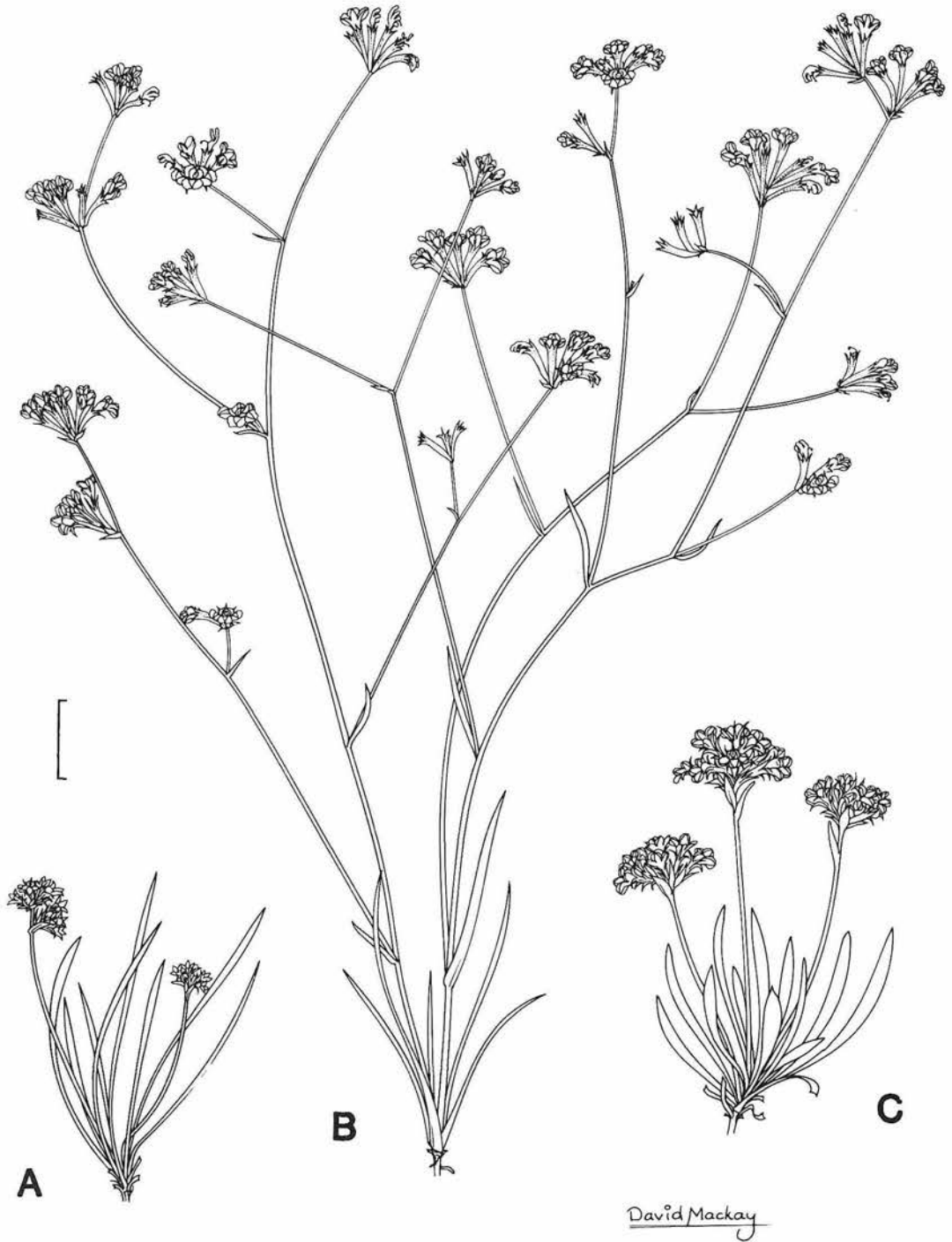
Figure 1. Anthotium humile . A — habit (from George 1989, PERTH). Anthotium junciforme . B — habit (from Keighery 3844, PERTH). Anthotium rubriflorum . C habit (from Morrison 199, SYD). Scale bar: 2 cm.