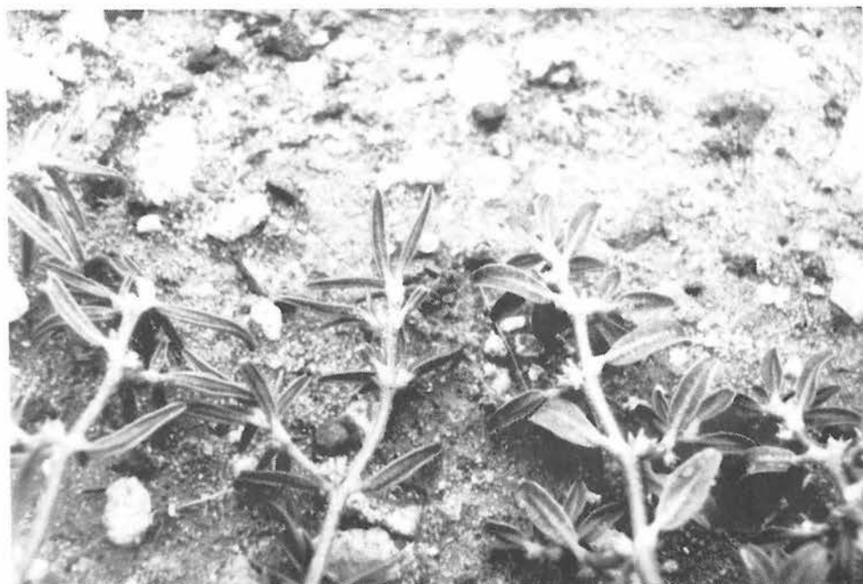
Figure 2. Two different forms of Trianthema triquetra occurring sympatrically in the southern Kimberley region near Fitzroy crossing (Bittrich & Jenssen 18612 (left), 18610 (right)).