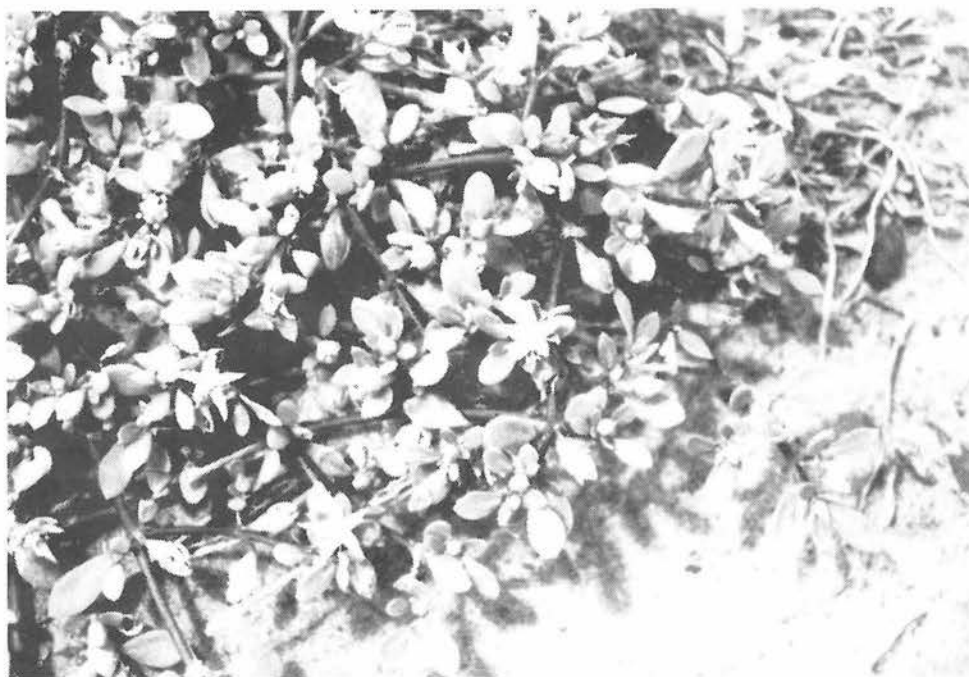
Figure 1. Trianthema kimberleyi at the type locality in the southern Kimberley region.