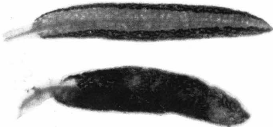
Figure 3. Leaves of two forms of Trianthema triquetra in abaxial view with different anatomy (Bittrich & Jenssen 18612 (above), 18601 (below)).