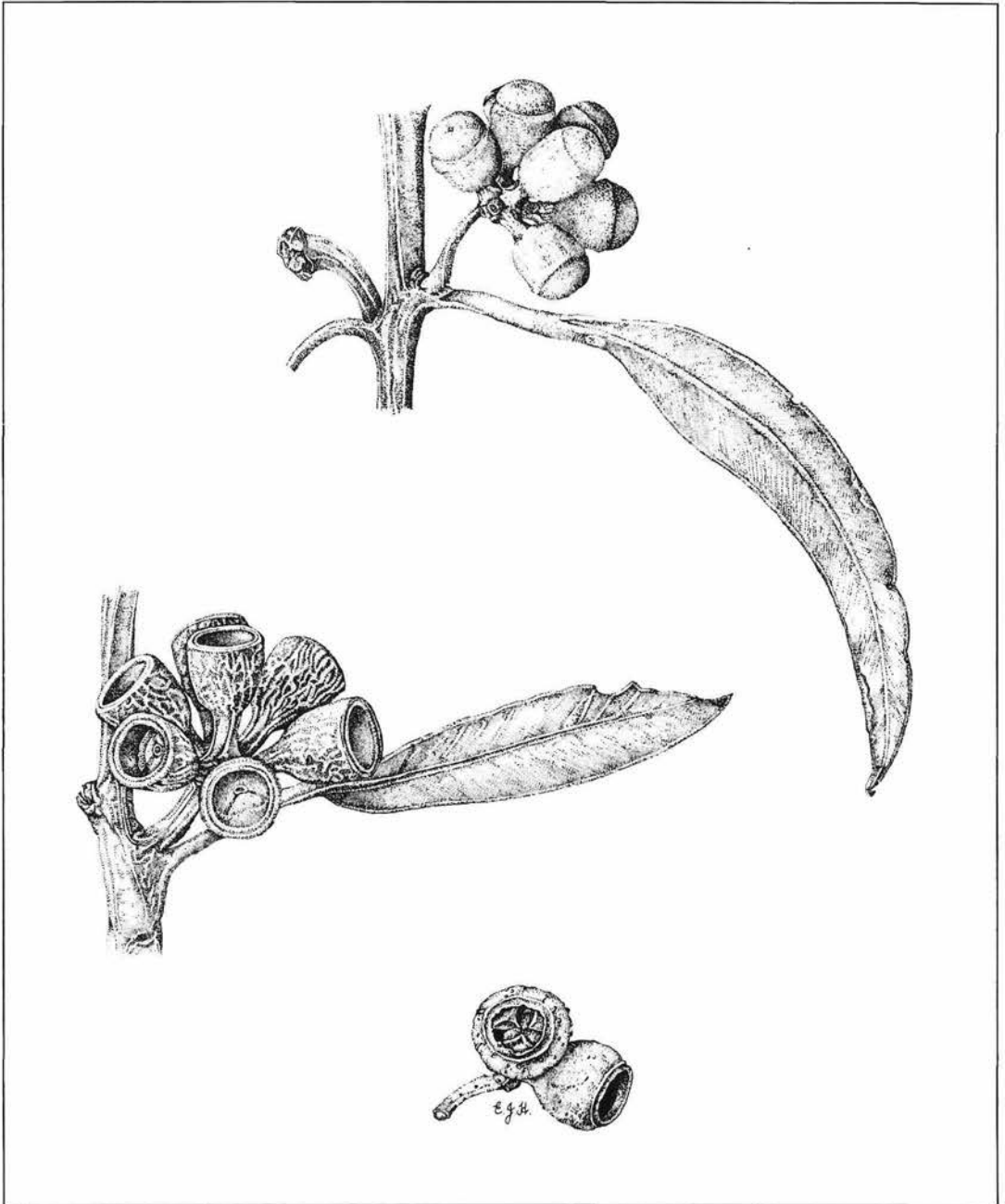
Figure 1. Eucalyptus semota buds, fruit and adult leaves (scale 1 cm = 2.5 mm).