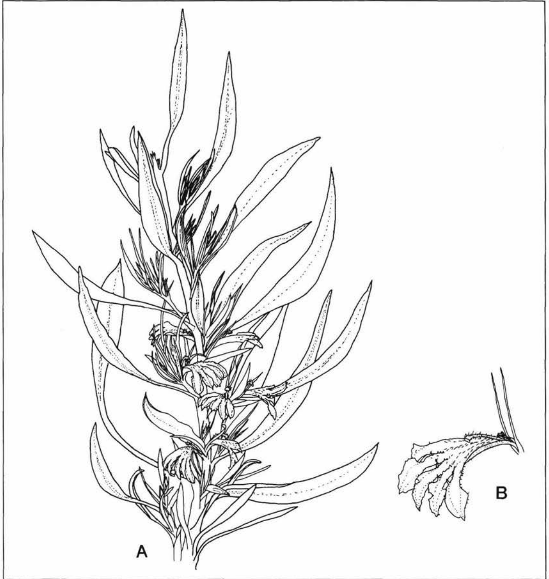
Figure 1. Scaevola oldfieldii A - flowering branch (x 0.7), B - flower (x1.3). Based on photographs taken of the 'Z-Bend' population (Kalbarri National Park, September 1991).

Other specimens examined. WESTERN AUSTRALIA: 12 miles [19.3 km] N of Northampton on North West Coastal Highway, 2 Sep. 1970, A.S. George 10731 (PERTH); Clay flats Hutt River, 11 Nov. 1972, B.M.S. Hussey (PERTH); 28°56'S, 115°09'E, 4.8 km W of Casuarina, 5 Dec. 1976, R.J. Hnatiuk 760336a (PERTH); 15.7 km W along fire track towards 'Z-bend' from eastern boundary to E side of Murchison River, Kalbarri National Park, 27°38'10"S, 114°30'10"E, Sep. 1991 W.P.A. Worboyce 671 (MEL); 27.6 km S of Northampton grain silo complex along North West Coastal Highway = 14.8 km N of Nabawa turn-off on edge of Geraldton, Sep. 1991, W.P.A. Worboyce 798 (MEL); West end of fire break to back of 'Z-bend', upper slopes of Murchison River, Kalbarri National Park, 28 Sep. 1991, D.R. & B. Bellairs 1452A (PERTH).