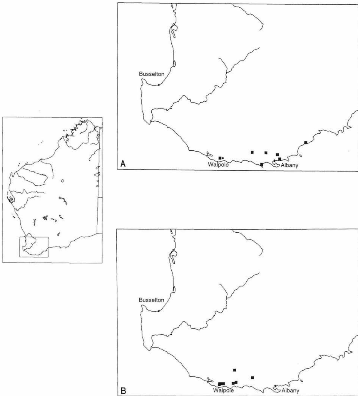
Figure 2. Distribution in the south-west of Western Australia. A – Sphaerolobium pubescens . B – Sphaerolobium rostratum .