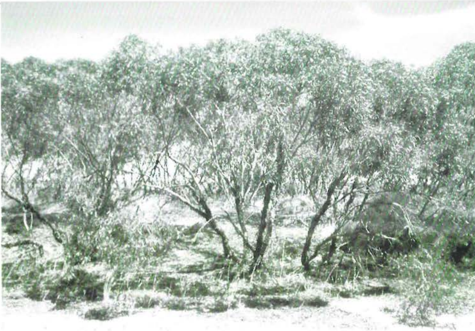
Figure 3. Eucalyptus calycogona subsp. trachybasis habit from south of Pinnaroo, South Australia.