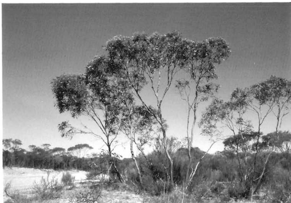
Figure 1. Eucalyptus calycogona subsp. calycogona habit from between Darke Peak and Mangalo, Eyre Peninsula, South Australia.

Selected specimens examined. WESTERN AUSTRALIA (west to east): 15 km N of Lake Grace, 8 Aug. 1984, M.I.H. Brooker 8619 (AD, CANB, PERTH); 11.4 km NNW of Hyden towards Narembeen, 3 Oct. 1975, M.I.H. Brooker 4993 (AD, CANB, PERTH); 2.9 km E of Rabbit Proof Fence on Varley–Southern