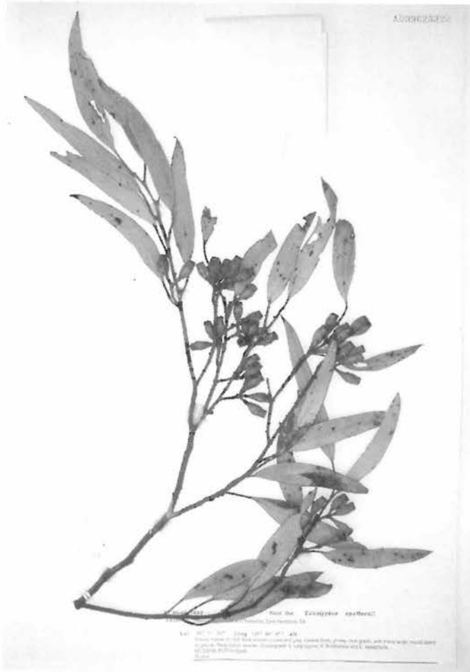
Figure 5. Holotype of Eucalyptus calycogona subsp. spaffordii (D. Nicolle 1682).

diversifolia ). E. calycogona subsp. calycogona and spaffordii are completely sympatric and few intergrades are known, however, considering the differences between these two subspecies are quantitative and individuals with coarse leaves, buds and fruits of subsp. calycogona and trachybasis elsewhere approach subsp. spaffordii in leaf, bud and fruit morphology, it is here maintained at an infraspecific rank.