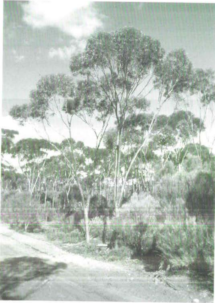
Figure 8. Eucalyptus prolixa habit from north of the Bremer Range, Western Australia.

J.B. Cleland s.n. (AD); 24.5 and 35.1 km W of Cave Hill on track to Victoria Rock road, 30 Mar. 1997, M. French 174 (PERTH); Norseman–Hyden road, 5.1 km W of Coolgardie–Norseman road, 32°01'04"S, 121°36'45"E, 18 Apr. 1997, R. Davis 3048 (PERTH); 4.5 miles [7 km] W along (L) turnoff, 6.4 miles [10 km] N of Norseman, 11 Nov. 1970, J. Baker 50 (AD, CANB, PERTH); 24.2 miles [39 km] S of Norseman, 13 Nov. 1970, J. Baker 60 (AD, CANB, PERTH); car park area at Jimberlana Hill, 5.9 km NE of Norseman, 16 Apr. 1995, B.J. Lepschi 554 & T.R. Lally (CANB, PERTH).