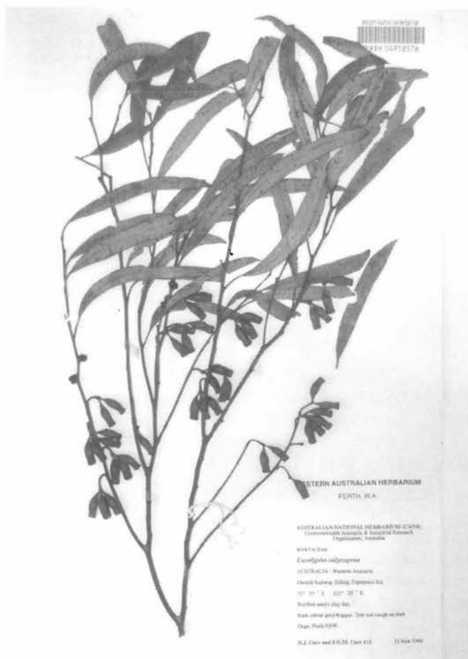
Figure 7. Holotype of Eucalyptus prolixa (S.G.M. Carr 615 & D.J. Carr).

Selected specimens examined. WESTERN AUSTRALIA (west to east): 1.4 miles [2 km] W of Bullabulling, 7 Mar. 1967, G. Chippendale 111 (AD, CANB, PERTH); Bremer Range track, 32°15'46"S, 120°31'52"E, 21 Apr. 1998, D. Nicolle 2281 (PERTH); Hyden–Norseman track, 10 km E of Mt Day turnoff, 12 Nov. 1987, A. Taylor 126 & A. Napier (PERTH); W of Coolgardie on highway, 31°01'20"S, 120°50'43"E, 15 Aug. 1997, M. French 249 (PERTH); Woodline, c. 100 km S of Coolgardie, 2 Sep. 1926,