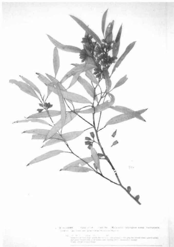
Figure 4. Holotype of Eucalyptus calycogona subsp. trachybasis (D. Nicolle 984).

Parsons & Rowan (1968) found that in the eastern part of its range, E. calycogona (subsp. trachybasis ) is found on heavier soils than the related E. gracilis , the spatial separation being a possible explanation for the lack of hybrids between these two species. A similar situation occurs in Western Australia with E. calycogona and E. prolixa occurring on generally heavier (more clayey) soils than the related E. gracilis , E. brevipes , E. celastroides and E. quadrans . E. calycogona subsp. trachybasis and calycogona are allopatric although plants of subsp. calycogona on north-eastern Eyre Peninsula do show some tendency towards subsp. trachybasis with occasional plants having some persistent bark around ground level. These plants are not considered to be intergrades but are subsp. calycogona with possibly some past genetic influence from subsp. trachybasis .