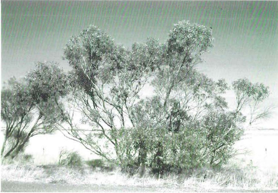
Figure 6. Eucalyptus calycogona subsp. spaffordii habit from between Cummins and Yeelanna, Eyre Peninsula, South Australia.

so, named the variety staffordii Blakely. As the taxon is here recognized as a subspecies, the opportunity is taken to correct the name to subsp. spaffordii .