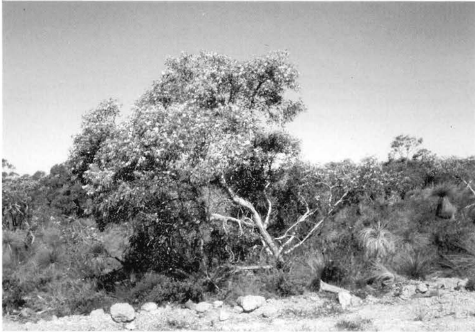
Figure 2. Eucalyptus gittinsii subsp. illucida habit north-west of Dandaragan.

Conservation status. Of scattered occurrence but locally abundant and not considered to be threatened. Known from several conserved areas including Lesueur National Park and Coomallo Nature Reserve.