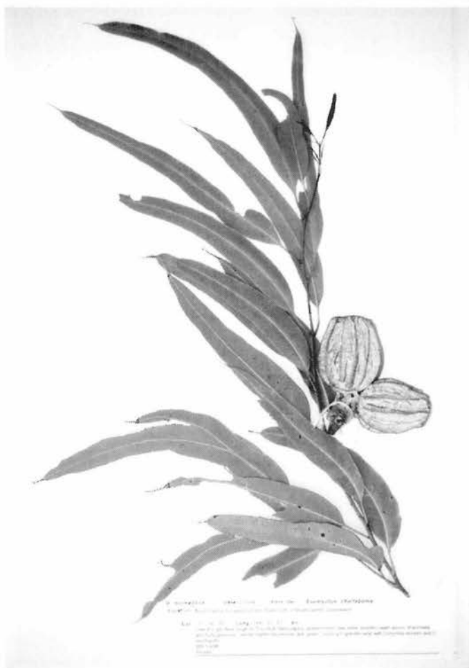
Figure 4. Holotype of Eucalyptus chartaboma (D. Nicolle 2509).