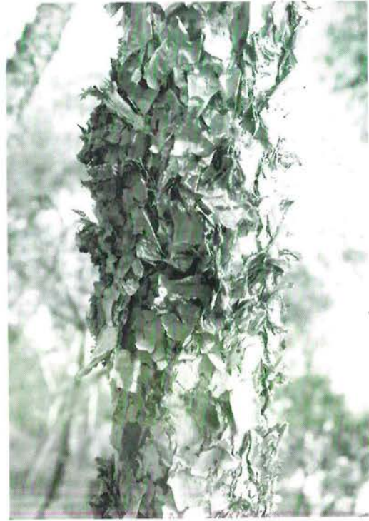
Figure 6. Bark on lower trunk of Eucalyptus chartaboma .