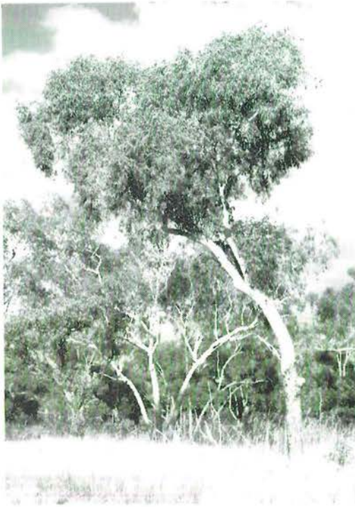
Figure 5. Eucalyptus chartaboma habit from between Pentland and Burra, Queensland.