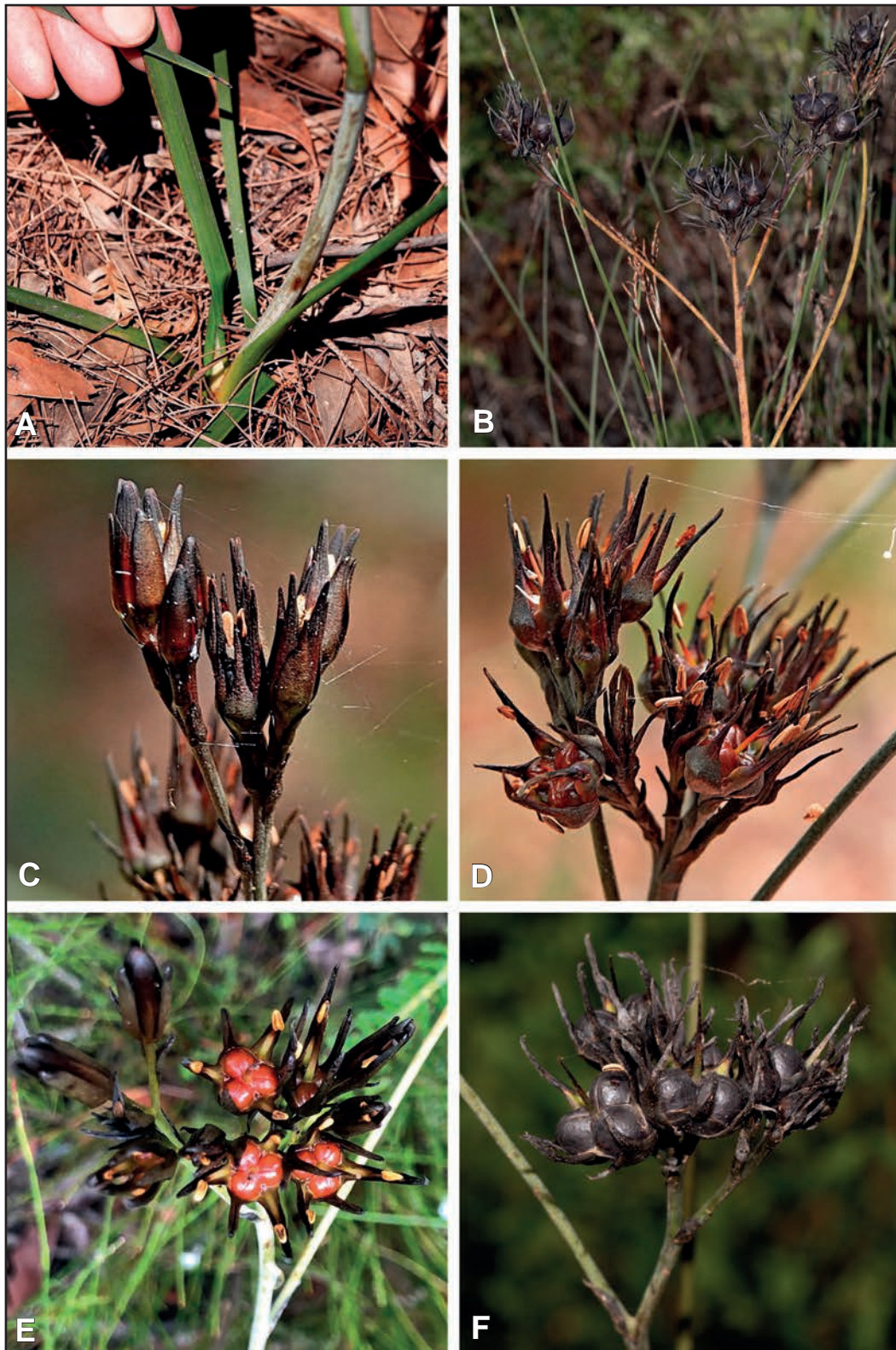
Figure 1. Haemodorum brevistylum. A – base of plant showing the flat leaves and glaucous inflorescence axis [scape]; B – fruiting inflorescence showing the panicle structure, with a dense terminal aggregation of flowers and major branches with relatively narrow branch angle and a dense flower aggregation on each, exceeding the terminal one in height; C – an aggregation of post-anthesis flowers showing perianth exterior colours; D – two aggregations of late post-anthesis flowers showing developing fruits and the positions of petal tips, anthers and style tips; E – a flower aggregation from above showing flowers at anthesis (top left) with petals closed, as usual in Haemodorum, shorter sepals and older flowers showing red well-developed immature fruits and perianth internal colours; F – a flower aggregation with dark brown to black mature fruits.