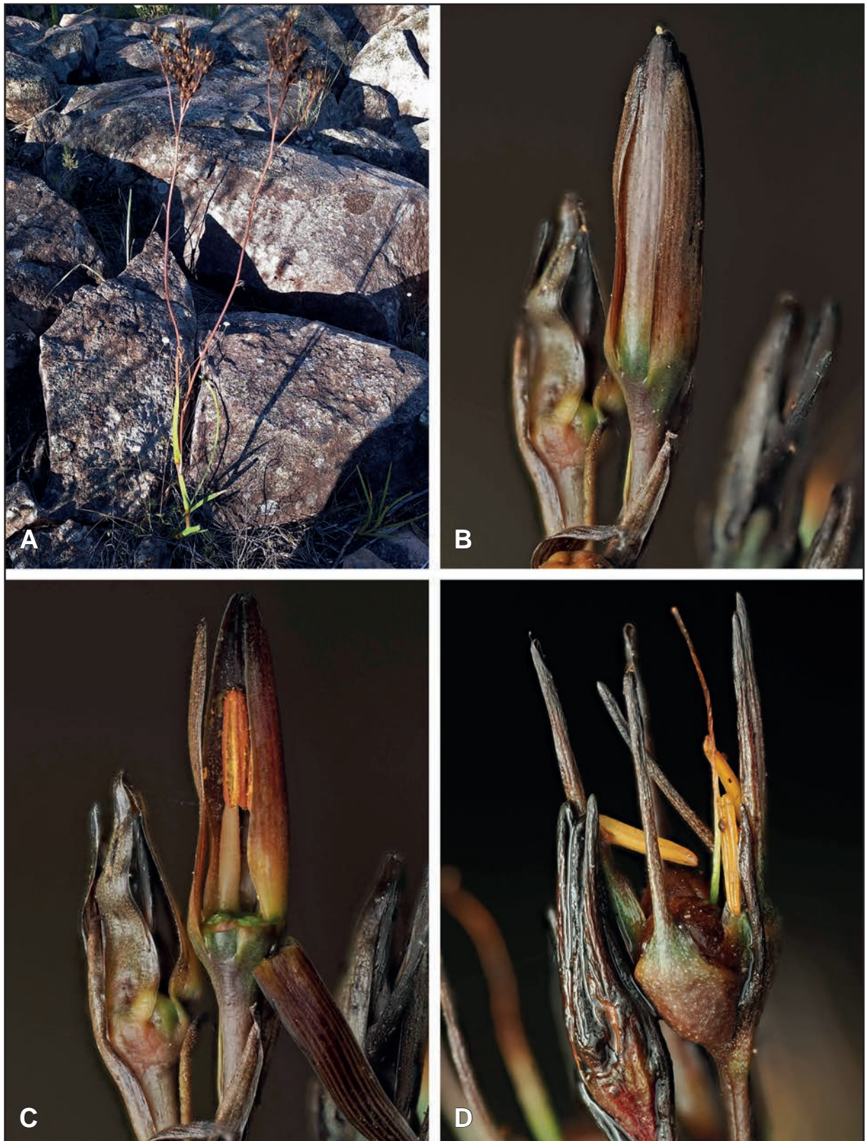
Figure 3. Haemodorum celsum . A – a plant with two inflorescences showing major branches with relatively narrow branch angles and flowers in dense aggregations on terminus and major branches; B – flower (centre) at anthesis with closed perianth with brown sepals and petals green at the base, stigma just showing above petal tips and bracteoles distinctly separated from the flower base; C – the same flower with a petal and a sepal removed, showing a stamen well-enclosed within the flower (style not shown); D – a flower (right) with a dull reddish full size immature fruit and style as long as the persistent perianth. Photographs by Jeremy Bruhl, W of Invergowrie (Voucher: J.J. Bruhl & J.T. Hunter JJB 3875, NE).