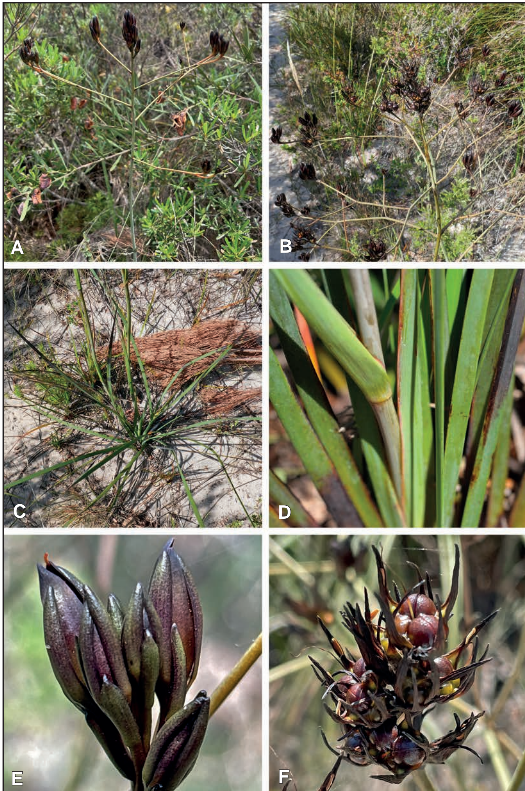
Figure 4. Haemodorum collevatum. A – an inflorescence at anthesis showing the wide branching angle, small flower aggregations and glaucous inflorescence axis [scape]; B – two inflorescences with flowers at anthesis and developing fruit showing repeated branching, wide branch angles panicle structure and small flower aggregations; C – base of plant with flat leaves and two inflorescence axes; D – part of an inflorescence axis showing glaucous surface, a green leaf-like bract and flat leaf blades; E – a flower cluster showing two flowers at anthesis with perianth closed, green and partly black sepals and reddish brown petals, the long style with stigma shortly exposed above tips of petals and green and blackish bracteoles; F – full size immature dull reddish fruits. Photographs A–C, E, F, from Awabakal Nature Reserve; D from Newcastle.