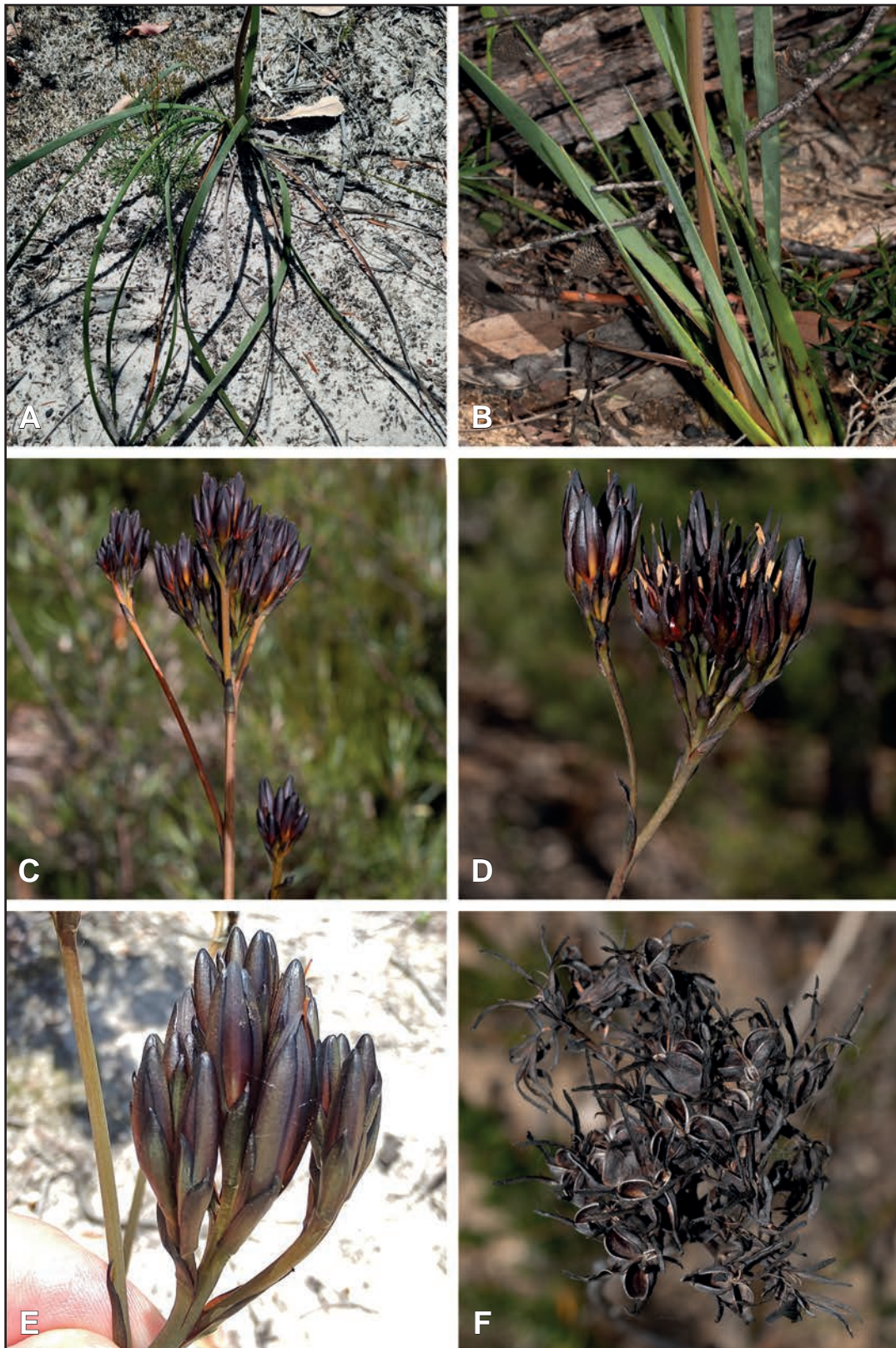
Figure 6. Haemodorum planifolium. A – plant base with several leaves; B – basal leaves with flat blades and an inflorescence axis; C – an inflorescence showing its structure with a large terminal flower aggregation and two smaller aggregations on major branches (flowers mostly at anthesis); D – upper part of an inflorescence showing the terminal flower aggregation (flowers mostly post-anthesis with red developing fruits) and a major branch with a smaller flower aggregation (flowers younger, at anthesis with protruding style tips showing entire stigmas); E – a flower aggregation showing greenish brown sepals without green at base, reddish brown petals and bracteoles positioned close to flower bases (flowers either at anthesis with protruding style tips or pre-anthesis); F – old dehiscent fruits. (A, E) Royal National Park, (B–D, F) near Leura, Blue Mountains.