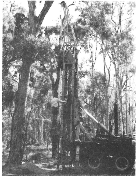
PLATE 1: Gemcodril H13 mounted on Bedford Truck at Site W11.

Samples for analysis were obtained from the soil surface and from the press shoe (the latter usually at 76 cm vertical intervals). The samples from the press shoe were immediately subdivided into two parts, one of which was used for the analysis of specific electrical conductivity (EC), total soluble salts (TSS), sodium chloride (NaCl) and pH. The other portion was obtained from a section of known volume, transferred to a moisture-content tin, sealed and subsequently processed for gravimetric moisture content and for bulk density. The occasional use of a cutting shoe in compacted strata resulted in some incomplete cores being recovered.